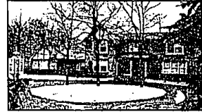
THIS HOUSE HAS IT ALL! Year-round vacation home in Beverly Hills. Pool with waterfall, spa, sauna and self-contained pool area. Family room, 2 libraries, 3 bedrooms, 3½ baths. Breakfast room overlooks pool. WDWI (644-6300) B08878