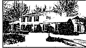
ADD THIS ALL UP! Great location, private wooded lot, Bloomfield Schools, 1st floor master, large rooms for family or formal entertaining. All in desirable Overbrook. 5 bedrooms, family room. Pool. $429,900. (644-6300) B00267