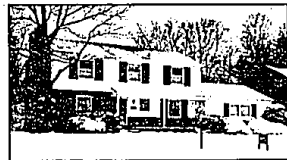
STATELY BEVERLY HILLS COLONIAL in the Birmingham School District has been updated and redecorated. Living room fireplace, both den and family room, 4 bedrooms and rec room. Very convenient location. $208,000. (644-6300) B08663