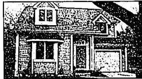
NEWER 1990 CONTEMPORARY located in up and coming Royal Oak. Master with walk-in closet overlooking a two-story living room. Central air, oak cabinets, cedar deck are only some of the amenities. $114,900. (851-5500)