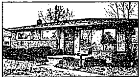
GREAT ROYAL OAK RANCH. Don't pass this one by! Over 1300 sq. ft. with cozy quiet family room with fireplace, hardwood floors, updated kitchen, newer vinyl windows, finished basement with bar. Must see. $84,900. (851-5500) B07532