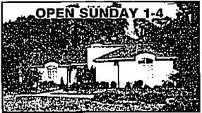
PRIVATE WOODED ACRE in prestigious area with lake privileges. Stunning custom kitchen with ceramic floor, 1st floor master, library. $449,900. 5212 Deer Run, O.L., N. of Pontiac Trail, E. of Orchard Lake Road. (851-5500)