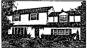
PRESTIGIOUS Bloomfield Village address for this four bedroom colonial, dramatic interior with family room and library overlooking private rear yard. Updated kitchen with breakfast area. Large sun deck. $275,000. (644-6300) B08737