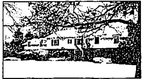
OUTSTANDING LOCATION AND 2 ACRE SETTING in heart of Bloomfield Hills. 4 bedroom colonial has new kitchen by Lenore, step-down living room, dining room. Garden room. Surrounded by million dollar homes. (644-6300) B08621