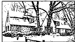
LOCATION, LOCATION, LOCATION - Wooded privacy, lovely gardens and history surrounds former gardener's cottage in City of Bloomfield Hills. A child's dream with a cow barn and old milkhouse. $449,000. (644-6300) B09189