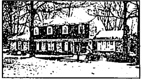
BEAUTIFULLY MAINTAINED HOME overlooking Wood Lake. Library, family room, 4 bedrooms, 3½ baths, 3 fireplaces, first floor laundry, rec room and a walk-out lower level. Bloomfield Hills Schools. $419,900. (644-6300) B08753