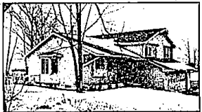
BEAUTIFUL LAKE VIEWS and privileges come with this cute three bedroom, three bath contemporary on an island! Cathedral ceilings in great room and master. Over 600 square foot dock on two levels. $174,900. (644-6300) B08804