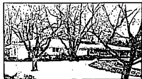
GRACIOUS FOUR BEDROOM RANCH in the City of Bloomfield Hills. Beautifully landscaped, private setting with outstanding views. Banquet sized dining room, family room, elegant master bath with whirlpool tub. (644-6300) B08941