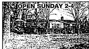
OPEN SUNDAY 2-4 LAKE FRONTAGE on Lower Long Lake alongside a canal to Forest Lake near Forest Lake Country Club. Family room, 5 bedrooms, walk-out lower level. 1515 Lochridge, B.H., N. of Long Lake, W. of Franklin. (644-6300) B09420