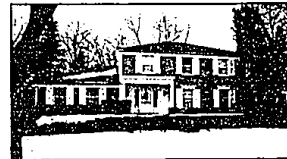
OBERTI BUILT HOME with many improvements. Oak floors in dining and garden rooms. Family room, four bedrooms, 3½ baths and recreation room. Wonderful home on beautiful lot in an excellent location. $499,900. (644-6300) B05883