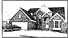
OUTSTANDING ARCHITECTURAL DESIGN featuring 2-story living and dining rooms, 2-way fireplace with built-in bookshelves, library with French doors and vaulted ceilings, 1st floor master suite. Rochester. $199,900. (851-3500)