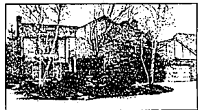
HIGH ON A HILL in Quail Ridge Sub. Entertain in grand manner in this spacious family home offering fireplaces in the master, library, family room and living room. 2 furnaces, 2 central air units. Rochester. $319,900. (651-3500) 105311