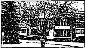
LARGE UPPER BLOOMFIELD HILLS CONDO UNIT, nicely located in rear of complex, has two bedrooms, two baths, dining room and den with balcony. All kitchen appliances included. Central air. Pool. $122,900. (644-6300) B08695