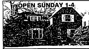
CHARACTER AND CHARM. Open floor plan colonial with light oak woodwork in living room. Upgrades in '88: furnace, roof, electrical. $159,000. 22 Oakdale, Pleasant Ridge, S. of 10 Mile, W. of Woodward. (689-7300) 504212