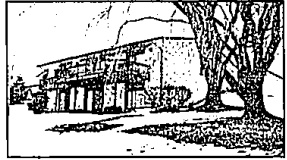
BREATHTAKING VIEWS of the Wabash Country Club golf course and Hahnos Lake. Unique floor plan with 1st floor master with his/her baths and closets. Library. Walk-out lower level to patio. $250,000. (644-6300) B08876