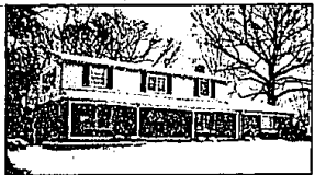
LIGHT AND AIRY COLONIAL in wooded, park-like Bloomfield Hills setting. Family room with fireplace, 4 bedrooms. Rec room. Hardwood floors. Newer furnace and central air. Cedar deck with hot tub. $322,000. (644-6300) B08711