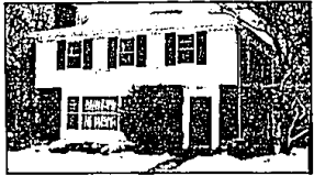
A JEWEL OF A HOME. New kitchen with oak cabinets, living room fireplace, bright family room and three bedrooms. Cove ceilings, hardwood floors. Two car garage. Birmingham Schools. $199,900. (644-6300) B08797