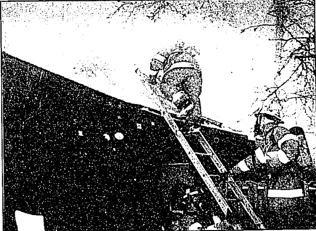
Garage fire: Hills firefighters battle a fire in a garage on Barfield at about 6 p.m. Monday.