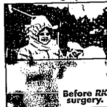
Before RK surgery.