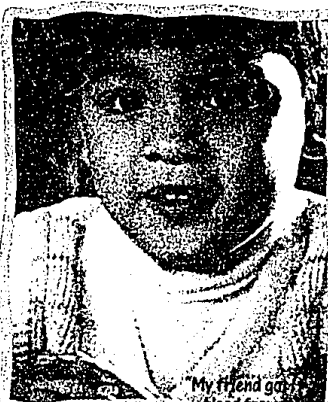
My friend got blood from the Red Cross and got all better again."