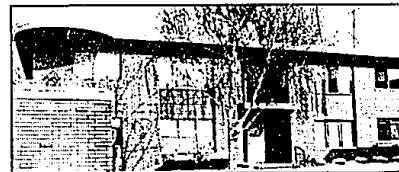
NORTH ROYAL OAK

Near Kirk-in-the-Hills, this updated brick ranch is absolutely move-in ready. Wonderful kitchen with ceramic tiled floors, master bedroom with a dream bath and French doors leading to the library or third bedroom. Exquisitely landscaped. $229,900 Call 647-8100.