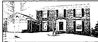
LOVELY TO LOOK AT

Better than new! This two year old, four bedroom colonial is on a premium wooded lot next to nature area. A host of upgrades including French doors to a two-level deck, family room and living room with fireplace and exceptional landscaping. Beautifully decorated. $229,900 Call 647-8100.