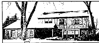
OPEN SUNDAY 1-4

Two bedrooms, two full baths, spacious end unit condominium located on beautifully maintained grounds. Abundance of storage space, kitchen with all appliances and laundry hookup. Swimming pool and tennis court in complex. Carport. $65,900 Call 647-8100.