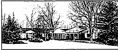
PRIVATELY TUCKED AWAY

This huge five bedroom, four and half bath colonial backs to a wooded commons area for executive privacy. Generously proportioned family room with fireplace, library, new kitchen and a three car garage. Well maintained. $360,000 28328 Harwich, S. of 13 Mile, E. of Middlebelt. Call 644-3500.