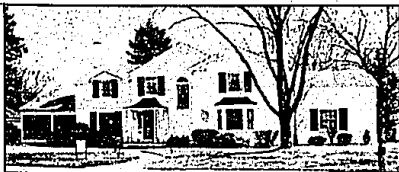
OPEN SUNDAY 1-4

Within a block of Quarton Lake, this vintage five bedroom colonial has the charm, features and location you have been looking for. Hardwood floors, rear staircase. Huge master bedroom and a screened porch for summer evenings. $450,000 1160 Lake Park N. of Maple Rd., W. of Woodward. Call 644-3500.