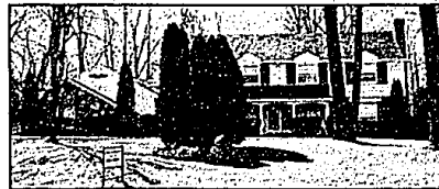
OPEN SUNDAY 1-4

A one-owner brick ranch backing up to Lincoln Hills Golf Course. This newly listed three bedroom home has been well maintained. Master bedroom with bath, screened porch overlooking the large yard and golf course. New furnace with central air. $260,000. 1171 Fox Chase, W. of 14 Mile, W. of Cranbrook. Call 644-3500.