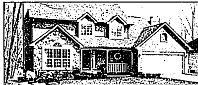
THOUSANDS IN UPGRADES

Look around, reasonably priced, four bedroom Bloomfield colonials are hard to find. Consider the walk-to-school location of this one. Family room with fireplace, updated baths, hardwood floors and neutral decor. Well maintained. $194,900 Call 647-8100.