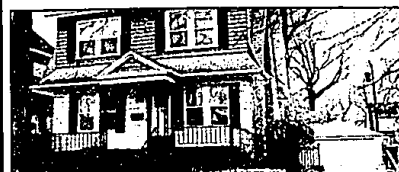
OPEN SUNDAY 1-4

Stop out and see this executive ranch on a beautifully landscaped setting. Great Room, with fireplace, walks out to a large deck. Walk-out lower level family room with access to patio. Master bedroom with bath. Simply wonderful! $219,900. Call 647-8100.