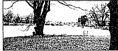
DROP ANCHOR HERE

On a double lot, this charming center entrance colonial is just what you have been waiting to see. Gracious formal living room and dining room, huge family room with fireplace and a paneled library. Finished basement, hardwood floors except kitchen and decorated in soft neutrals. $423,500 Call 644-3500.