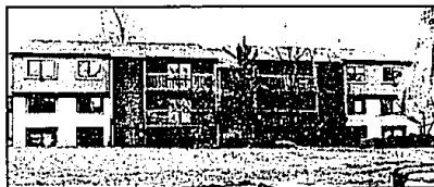
LAND CONTRACT TERMS

And even better to own. You will find this move-in condition, four bedroom colonial in a close-in subdivision not far from Birmingham. Large family room with fireplace, library and finished basement. Kitchen with oak cabinets and floors. Large deck. $245,900 Call 647-8100.