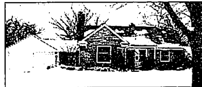
OPEN SUNDAY 1-4

A new white kitchen opens to a family room with fireplace in this handy Bloomfield condominium. Large master bedroom with full bath, formal dining room and a two car attached garage. Easy access to everything. $112,500. 1572 Georgetown, S. off South Blvd., E. of Opyko. Call 644-3500.