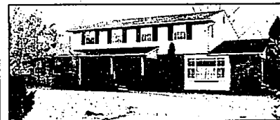
GIVE ME FIVE

Located in the Shrine area, this wonderful Dutch colonial has it all. Leaded glass windows, built-in bookcases, hardwood floors. French doors to screened porch. There is Old World charm with all the modern updates. $194,900. 1613 Sycamore, N. of 12 Mile Rd., E. of Woodward. Call 647-8100.