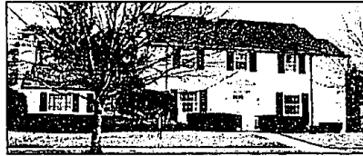
A VILLAGE DELIGHT

In a prime Bloomfield neighborhood, this five bedroom ranch is situated on a 1.5 acre lot well off the road. Strictly custom, there is an extensive use of crown moldings and a host of updates including a newer kitchen and roof. Huge walk-out lower level to an inground pool. $570,000 Call 644-3500.