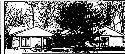
WON'T LAST LONG

Shopping, transportation and good places to eat are within walking distance of this budget-priced, two bedroom condominium. Extras include hardwood floors, central air and all new appliances including washer and dryer. Good storage. Reduced to $52,500. Call 644-3500.