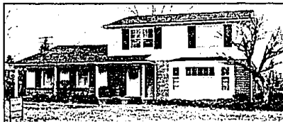
AN UNPRETENTIOUS PRICE

Enjoy beautiful views from the 212' of Wing Lake frontage that comes with this three bedroom Bloomfield ranch. The private cul-de-sac setting is perfect for expansion or renovation. Good close-in Bloomfield location near shops and transportation. $339,000 Call 647-8100.