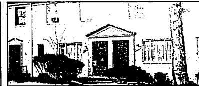
GARAGE THE CAR

Five good sized bedrooms, that is. This very spacious center entrance Bloomfield colonial features Bloomfield Hills Schools, a floor plan perfect for the large family and plenty of living space that includes a family room and a library. $215,000 Call 644-3500.