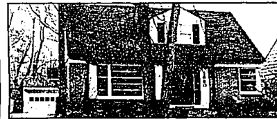
A FAMILY ROOM ADDITION

Pride of ownership is apparent. Family room with fireplace and doorwall to a new deck. Large kitchen adjoins the family room, walk to Birmingham schools. Bright, light and immediate occupancy. $217,900. 781 N. Shady Hollow, N. of Big Beaver, W. off Adams Rd. Call 644-3500.