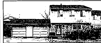
OPEN SATURDAY 2-5

A terrific Cape Cod in a top North Royal Oak location. New white kitchen with top-of-the-line appliances, master bedroom with bath and an English style pub in the finished lower level. Extra wide lot, two car garage. $156,900. 4431 Buckingham, S. of 14 Mile, W. off Woodward. Call 644-3500.