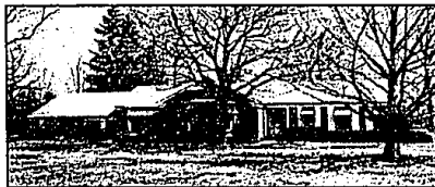
OPEN SUNDAY 1-4

Within a block of Quarton Lake, this vintage five bedroom colonial has the charm, features and location you have been looking for. Hardwood floors, rear staircase. Huge master bedroom and a screened porch for summer evenings. $450,000 1160 Lake Park N. of Maple Rd., W. of Woodward. Call 644-3500.