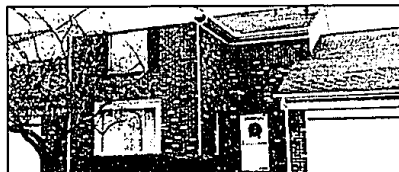
OPEN SUNDAY 1-4

Located in a popular Birmingham neighborhood, this just listed three bedroom bungalow has some fresh new decorating. The family room opens to a deck and pretty yard. Extras like a two car garage, hardwood floors and a larger-than-usual living room. $147,900 Call 644-3500.