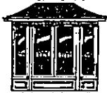
Add a touch of class with a new Bay or Bow.