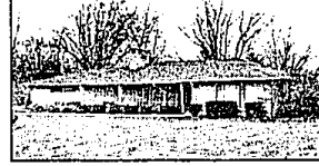
EXTENSIVELY UPDATED RANCH on large site in Bingham Farms. Marble countertop kitchen and ceramic tile floor. Living room fireplace, family room, 3 bedrooms, 2 baths. Immediate occupancy. $175,000. (644-6300) B07535