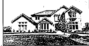
BLOOMFIELD HILLS COLONIAL has library, open, bright family room with studio ceiling, crown moldings, 4 bedrooms, hardwood floors, recreation room in walk-out basement and many upgrades. (644-6300) B11879