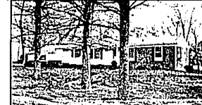
MOVE RIGHT IN. Freshly decorated ranch on beautiful Bloomfield site with a meandering stream viewed from living room and kitchen. 3 bedrooms, 1 full and 2 half baths. Carpeted walk-out basement. $147,000. (644-6300) B11839