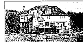
RIFE WITH ELEGANCE AND QUALITY. Magnificent tudor in Bloomfield with fabulous views from all four stories. Vaulted family room, five bedrooms, in-ground spa tub, sauna and steam shower. (644-6300) B11878