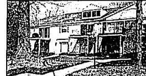
CONVENIENT CONDO LIVING. 3 bedroom upper end unit in well maintained Chestnut Hill complex with large trees, pines and privacy. White kitchen with all appliances. Updated bath. Central air. Deck. $52,500. (689-7300) S10503