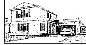
OPEN AND BRIGHT COLONIAL. Neutral decor. Family room could be formal dining room. Master has two walk-in closets. Central air. Builder's warranty. Seller offers $300 towards new carpet on upper level. $89,900. (689-7300)