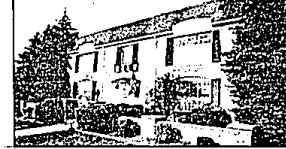
SPACIOUS FIRST FLOOR CONDO in heart of the City of Bloomfield Hills is exceptional. Dining room and sunny breakfast room both open to porch. Paneled 3rd bedroom or den. 2 car garage. $136,900. (644-6300) B11680