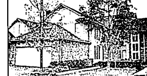
STUNNING TOWNHOUSE with two-story great room, magnificent hardwood flooring thru-out 1st level. Impressive living room fireplace. Family room. Master with two walk-in closets. Three bedrooms. $249,900. (644-6300) B75059