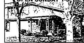
SUMMER FUN! Updated contemporary has canal frontage to all sports Sylvan Lake. 2 bedrooms on entry level, 2nd floor is master suite, Jacuzzi bath. $265,000. 1700 Maddy Lane, K.H., N. of Orchard Lake, E. of Cass Lake Road. (851-5500)