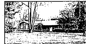
VERY EXPENSIVE LANDSCAPING! Bloomfield Hills three bedroom ranch has fireplaces in living and family rooms. Library. Professionally landscaped with brick patio and walkway. Much, much more. $195,000. (644-6300) B11797