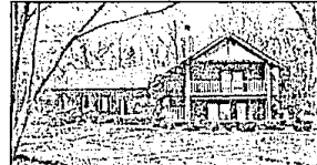
INVITING HOME tucked away in an intimate setting with views of Deer Lake. Gorgeous wooded lot. Open floor plan, dramatic high ceilings, driftstone fireplace, 3 bedrooms, 3 baths. Clarkston. $229,900. (651-3500) 105359