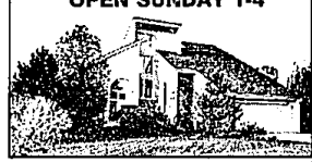
OPEN SUNDAY 1-4 STRIKING CONTEMPORARY. Professionally landscaped. Vaulted ceiling great room, upstairs loft and plant bridge. Beach privileges. $209,900. 8243 Hearthstone Ct., Commerce, N. of Richardson, W. of Union Lake. (851-5500)