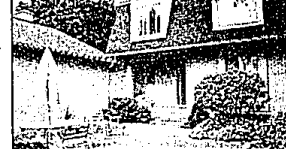
EXTRA SPECIAL ADAMS WOODS CONDO with many upgrades. Recessed lights in living room with fireplace, dining room, three bedrooms and 2 1/2 baths. Recreation room in partially finished lower level. $169,900. (644-6300) B05866