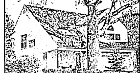
SOPHISTICATED GEN one block from Quorton Lake and within walking distance of downtown Birmingham. Three bedrooms. Two-story foyer with skylight, white kitchen with hardwood floor and island. $419,900. (644-6300) B10701