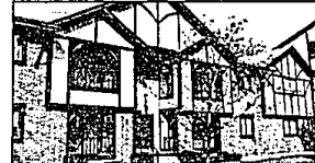
WONDERFUL FIRST FLOOR UNIT in Bloomfield Hills Four Seasons Condos. Two bedrooms, two baths, library, dumbwaiter from underground garage to hallway for groceries and packages. Neutral decor. $123,000. (644-6300) B11801