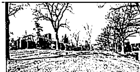
MAGNIFICENT SITE and residence on Island Lake. Landmark architecture by Alden Dow. Possibly the finest location in Michigan. A truly extraordinary residence. Six bedrooms, library, upper level family room. (644-6300) B11798