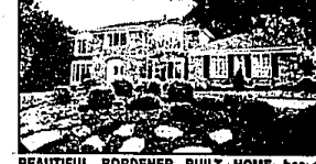
BEAUTIFUL BORDENER BUILT HOME has a paneled library, family room, four bedrooms, 3 1/2 baths, lower level with game room and sauna. Newer kitchen with garden window. Central air and patio. $484,000. (644-6300) B09325