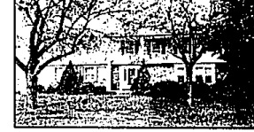
GOOD FAMILY HOME in Bloomfield Hills located on beautiful lot. Much recent updating. Florida room plus family room with fireplace, four bedrooms, finished rec room in walk-out lower level. $219,000. (644-6300)