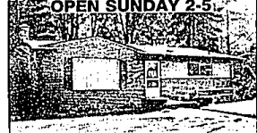
FARMINGTON HILLS brick ranch. Spacious and bright, fabulous remodeled kitchen with ceramic floors plus updated baths. Outdoor brick BBQ. Family neighborhood. $89,900. 21883 Brandon S., F.H.S. of 9 Mile, W. of Inokster. (851-5500)