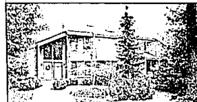
CITY OF BLOOMFIELD HILLS. Casual contemporary living. Wooded cul-de-sac setting. Magnificent two-story stone fireplace in great room. Four bedrooms including master with Kohler whirlpool tub. (644-6300) B09636