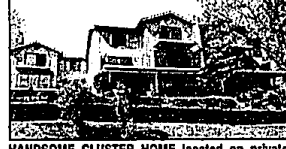
HANDSOME CLUSTER HOME located on private lane with Fox Lake frontage. Library, family room, three bedrooms, five baths, hot tub in walk-out lower level. Deck and patio. Superbly decorated. (644-6300) B11800