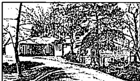
TROY. 2 1/2 acres on Natural Beauty road overlooking the river. Contemporary feel, expandable. Walk-out lower level and two 2 1/2 car garages! Birmingham schools. $239,900 (B410E) 647-6400