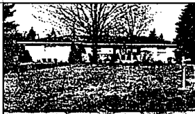
TROY. Custom built 3 bedroom, 2 1/2 bath brick/aluminum ranch with side entry garage on large private lot. Mature trees, deck and patio. Immediate possession. $169,900 (H617E) 641-1660