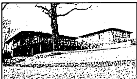
WEST BLOOMFIELD. Canal lot on Upper Long Lake. Spacious Ranch with 3 bedrooms, 3 baths, walk-out lower level with fireplace and wet bar, central air and much more. $169,500 (M254E) 647-6400