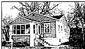
BIRMINGHAM. Good value with open floor plan and some updating. Close to shopping and transportation. Immediate occupancy and appliances stay. Call for appointment. $79,900 (B139E) 647-6400