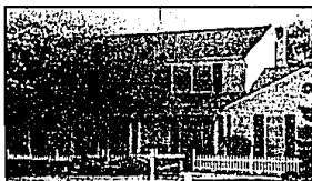
TROY. Red Maple Court - Charming spacious 4 bedroom, 2 1/2 bath New England Colonial on tremendous private treed site. $269,900 (RMC241E) 641-1660