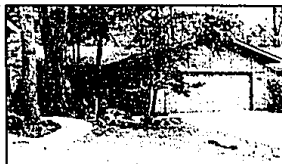
WEST BLOOMFIELD. Totally updated detached Contemporary Ranch Condo nestled in a unique, secluded wooded pine tree setting. Ceramic tile foyer, open floor plan. $164,900 (F228E) 851-4400