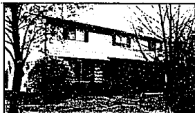
TROY. Immediate occupancy, 4 bedrooms, 2 1/2 baths, updated kitchen, great neighborhood, well maintained, 2 year old furnace, new Troy High. $139,900 (L339E) 641-1660