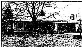
SOUTHFIELD. Birmingham Schools. Spacious 3 bedroom Tri-Level in family neighborhood. Family room with fireplace, 2 1/2 baths, beautiful back yard. $124,500 (B186E) 851-4400