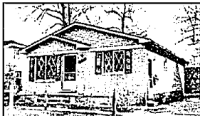
BIRMINGHAM. Freshly painted and newly carpeted, this 3 bedroom home is close to shopping and transportation. Large kitchen and full basement. Great value! $99,900 (L122E) 647-6400