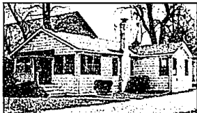
WEST BLOOMFIELD. Affordable 3 bedroom home with lake privileges on Walnut Lake. Move-in condition, double lot and lots of growth potential. Call today! $103,700 (L220E) 647-6400