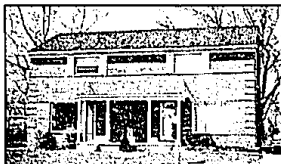
ROYAL OAK. Beautifully decorated 2 bedroom, 1 bath, half of a duplex with full basement, private patio with fabulous view and one year home warranty included. $74,900 (O252E) 647-6400