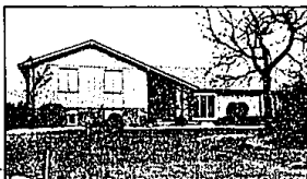
WEST BLOOMFIELD. Magnificent Waterick 4 bedroom, 4 1/2 bath split-level Contemporary sizzles with amenities. 2 fireplaces, 2 wet bars and Bloomfield Hills schools. $279,900 (C213E) 647-6400