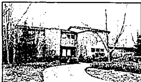
ORCHARD LAKE. Backing to lush woodlands this 4 bedroom Contemporary is filled with the best of everything! Great room, 2-story dining room, finished lower level. $399,000 (C449E) 851-4400