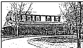
WEST BLOOMFIELD. Large stately family Colonial on over an acre lot. Dining room, family room, natural fireplace, updated kitchen, finished basement, 1st floor laundry. $224,000 (V744E) 647-6400