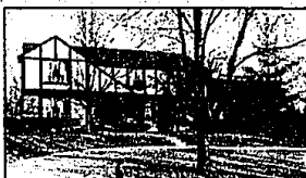
BLOOMFIELD HILLS. Quality Plus! 4 bedrooms, 2 full and 2 half baths, 2nd floor laundry, finished room in basement. Great Executive home. Home Warranty. $399,900 (BW755E) 641-1660