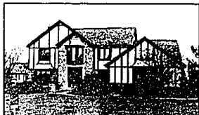
ROCHESTER HILLS. Stunning Tudor, 2 1/2 baths, 4 bedrooms, professionally landscaped, automatic sprinklers, full security system, finished basement, 3+ car garage. $289,900 (QR329E) 641-1660