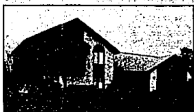
BLOOMFIELD TWP. Beautiful 4 bedroom Contemporary. Neutral decor, cathedral ceilings, double fireplace, upper loft sitting room, large deck. Backs to commons. $254,000 (Y516E) 851-4400