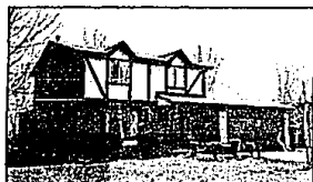
FARMINGTON HILLS. Super family area. This lovely Tudor features 3 bedrooms, large family room with cathedral ceiling and a first floor laundry. Dream house! $125,777 (F214E) 647-6400