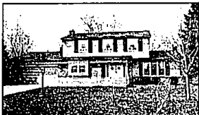
BLOOMFIELD. 4 bedroom, 2 1/2 bath Colonial. Many recent updates. New kitchen, new carpeting, country decor, sub has swim club. $179,900 (H162E) 641-1660