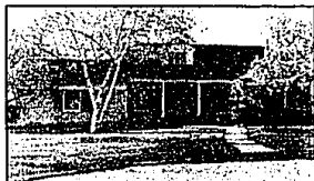
BIRMINGHAM. Charming Cape Cod in Birmingham Hills sub features 4 bedrooms, 2 1/2 baths, 2 fireplaces, Florida room and a magnificent Inground pool, updated kitchen. $214,777 (N118E) 647-6400