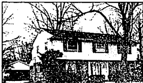
BIRMINGHAM. Poppleton Park Colonial with 4 bedrooms, 2 1/2 baths, family room and full basement. Great location, just a short distance to the park. Fireplace and more! $292,500 (M669E) 647-6400