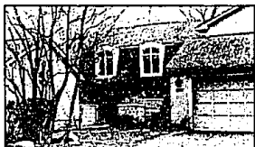
BLOOMFIELD. Come see this most beautiful unit in Adams Woods. Newly decorated to perfection with light wood floors, newer carpeting, wood railing to upper level. $184,000 (T120E) 647-6400