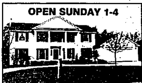
OPEN SUNDAY 1-4 FARMINGTON HILLS. 30338 Congress Ct. (N. of Grand River, W. of Drake). Impressive Georgian Colonial. 3 bedrooms, family room, 2 1/2 baths, cul-de-sac setting. $199,500 (C360E) 851-4400