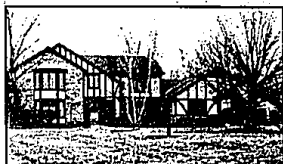
BLOOMFIELD HILLS. Elegant and comfortable. A perfect home with a 2 story exercise pool/sunroom with loft, library, family room, 2nd kitchen and walk-out lower level. $749,000 (B104E) 647-6400