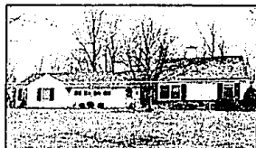
BEVERLY HILLS. Beautifully decorated 3 bedroom, 1 1/2 bath Ranch on treed lot offers top quality remodeled kitchen and dynamite family room addition. Call today! $159,900 (W303E) 647-6400