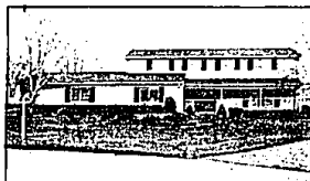
FARMINGTON HILLS. Close to everything, yet very private at end of court. 4 bedrooms, family room, living room, library, dining room, 2 1/2 baths, cul-de-sac setting. $199,900 (C303E) 851-4400