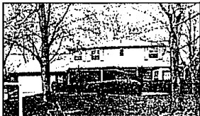
WEST BLOOMFIELD. Large 5 bedroom Winged Colonial on beautifully landscaped paradise. Library, family room, finished walk-out with "pub." Fine Lake privileges. $189,900 (F372E) 851-4400