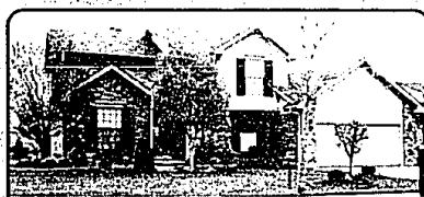
LOOKING FOR THE BEST? Stop looking - This 3 bedroom, 3 1/2 bath Tudor has everything from a custom fireplace in the great room to the built-in stereo speakers in the finished basement. $179,900. 851-6900 LAE-M42840