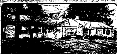
SPACIOUS BEVERLY HILLS RANCH Any living room and dining room each with fireplace, master bedroom has jacuzzi & walk-in closet. Central air, 2 1/2 car garage, and beautifully landscaped patio. $125,800. 647-7100 AMT-B-05351