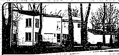
UNIQUE BIRMINGHAM CONTEMPORARY nestled in a private ravine setting. Unobstructed 180 ft. view of nature in the city. Spacious, 3 bedrooms, 2.5 baths, great master suite, and much more! $345,000. 647-7100 POG-B10637