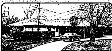
RAVINE AND SUNSHINE are just 2 of the many reasons to own this 3 bedroom ranch in desirable West Bloomfield community. Open, airy, Florida room and deck overlooks woods, pond and stream. $147,900. 851-6900 HAS-M42078