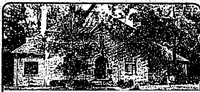
FRENCH NORMANDY HOME in Birmingham, has charm and character. Updates: Grabb kitchen, roof, driveway, appliances, separate summer screen house in rear yard. 5 bedrooms, 3 1/2 baths. $399,000. 647-7100 AWH-B-05672