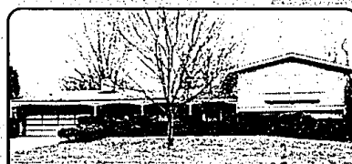
DESIRABLE BIRMINGHAM FARMS QUAD Open floor plan, cathedral ceilings, family room opens to patio and private backyard. Neutral colors, newer furnace, roof and air. $179,900. 851-6900 WOX-M42869