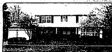
BLOOMFIELD HILLS Spacious brick family Colonial featuring 4 bedrooms, 2.5 baths, family room with fireplace, living & dining room for entertaining. If you are looking for larger home, this is for you! $185,000. 851-6900 COE-M43991