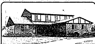
CHARMING COLONIAL One owner home. Neutral decor, kitchen open to family room with fireplace, library with built-in bookshelves, ceramic foyer, 1st floor laundry, and finished basement. $168,900. 851-6900 GRO-M42170