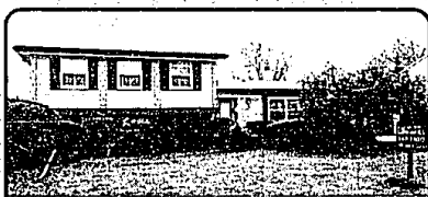
TRANSFEEER READY - Four or five bedroom. Much updating, including kitchen, carpet, paint and baths. Membership available in sub. Beachwood swim & tennis club. Walk to Schroeder Elementary. $175,000. 647-7100 ESS-B10725