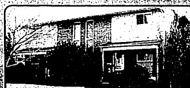
ROYAL OAK TOWNHOUSE $68,500. Recently redecorated, cut-in-each location. 3 bedrooms, 1 1/2 baths, full basement, plus appliances included. Private fenced yard. 647-7100 WOO-B09155

647-7100 1821 W. Maple Birmingham- Bloomfield