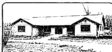
COUNTRY SETTING Fantastic, 2568 sq. ft. ranch featuring half basement, 3 car garage, wonderful amenities throughout, and two decks to view 3.37 acre grounds. May keep one horse. $187,000. 851-6900 FIE-M43634