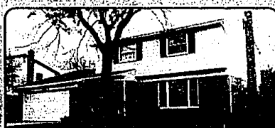
SHARP COLONIAL with Birmingham Schools. Much care is reflected in this 4 bedroom, 2 1/2 bath Colonial. Some updating, family room, living/dining room, roof in '92. Great location! $125,000. 851-6900 NOE-M43242