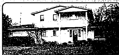
FINE FAMILY HOME ideal floor plan with 4 bedrooms, family room & library in West Bloomfield. Bright & sunny, on large lot in an area of winding streets and lots of trees. $190,000. 851-6900 GIT-M42028