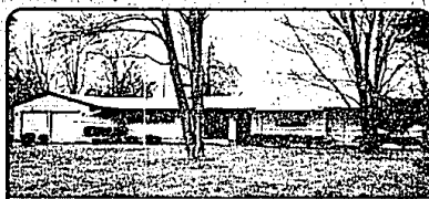
DON'T WAIT FOR THE SUMMER - Move right into this updated, 4 bedroom, 2 1/2 bath ranch with large rooms, lots of closet & storage. Beach access and boat well on Cass Lake Lagoon. $199,900. 851-6900 ERE-M42934