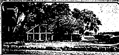
SUNRISE-SUNSET living on Pine Lake. Beautiful 6232 sq. ft. plus home. Three fireplaces, 4 bedrooms, 5.5 baths, spa, sauna, Florida room, dock. Lake views from every room! 647-7100. INN-B08209