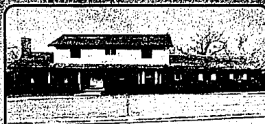
VERNON ESTATES - Beautiful neutral decor in this spacious 4-5 bedroom Colonial on wonderful lot. New kitchen, finished walk-out, library, marble foyer, and 3.5 baths. Bloomfield Hills Schools. $449,000. 647-7100 STH-B10353