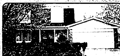
ENJOY SUMMER on the deck of this lovely family oriented Colonial with doorways from both family room & kitchen. All new carpet-kitchen-bath & lav. Four bedrooms ready for a new family. $149,900. 851-6900 RIE-M44814