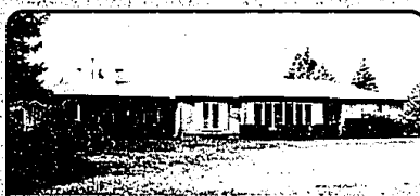
BEVERLY HILLS RANCH Large beautiful lot in Village of Beverly Hills. Updated throughout, new furnace, lots of light and space, and includes 2 fireplaces. Best buy with Birmingham Schools. $134,900. 647-7100 LER-B08236