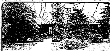
FOX-CROFT RANCH - Reminiscent of historic Greenfield Village. Authentic Early American decor, 3 stone fireplaces, private guest quarters or master suite, dining room with cooking hearth and more. $245,000. 851-6900. SUY-M09761