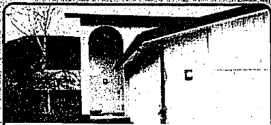
SPECTACULAR CONTEMPORARY CONDO with fabulous golf course views. Walk-out lower level with dance floor, plus wet bar, master suite with jacuzzi, his & hers closets. Bloomfield Hills Schools. $429,000. 851-6900 STS-M43009