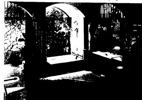
THE OUTDOORS is brought indoors in a Mediterranean setting for the Ultra/Bath bathing center. Dark woods effectively accent the bone beauty of the sculptured pool and shower tower.

In many areas of the country, there are contractors who specialize in creating "distressed" floors.