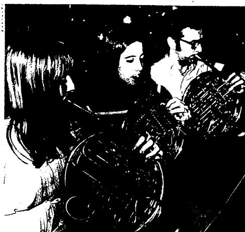
FRENCH TRIO — Three French horn players in the Farmington Community Concert Band practice together for the upcoming festival concert of National Music Week in Harrison High School at 3 p.m. May 2.