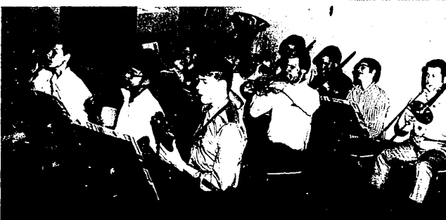
STAGE BAND — The newly formed Harrison High Stage Band will be one of the feature attractions at the festival concert May 2 as part of National Music Week in Farmington. The