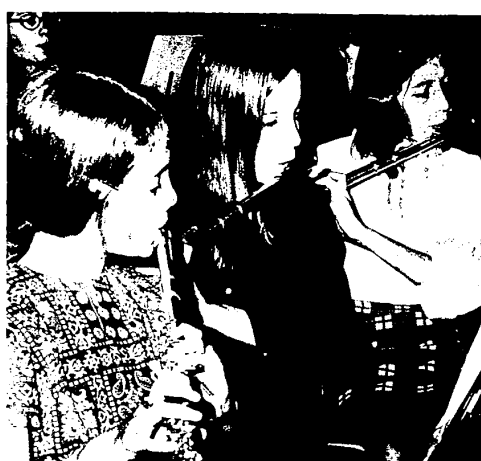
YOUNG MUSICIANS — The flute players above are members of the Elementary Honors Band of Farmington Schools which will be appearing in the festival concert May 2 in Harrison High School.