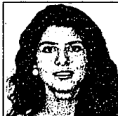
Meet a Brazilian!

Host families needed for international high school exchange students arriving in late August for the 1993/94 school year. Don't wait. We are currently seeking families.