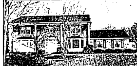
PRESTIGIOUS GATEHOUSE COMMUNITY. Gracious Colonial in desirable Ramblowood subdivision. Almost 3,000 sq. ft. in this updated, well cared for four bedroom home. Large rooms plus library. $249,900 (ED-W-42APP) B11488 Call 626-4000.