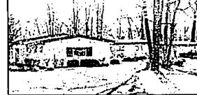
CASS LAKE VIEW. Lake view from a wonderful 1991 state-of-the-art kitchen. Deeded boat dock and beach lot just a few minutes walk from house. Three bedroom ranch with new bath. $244,900 (ED-B-01LER) B10738 Call 644-6700