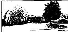
ARE YOU LOOKING for a Spectacular Home? This is an exciting all brick soft contemporary ranch with approx. 4700 sq. ft. in the city of Rochester. Partial first floor master suite. $469,000 (ED-H-295TO) Call 646-1400.