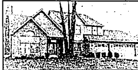
QUALITY IS THE WORD for this home. Custom features include gourmet kitchen, top of the line appliances. Cass Lake Gerundercut Bay. Wooded lot. 4 bedrooms. $342,900 (ED-W-82FOR) B07933 Call 626-4000.