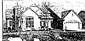
SOFT CONTEMPORARY with finished walk-out basement. Ceramic foyer, open staircase with oak banister, great room with soaring ceiling, skylites, crown moldings, first floor master suite, wood flooring. $362,000 (ED-W-64HAR) B11459 Call 626-4000.