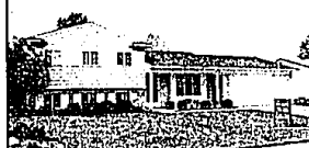
TERRIFIC TROY TRI-LEVEL. Walk to grade school from this lovely home in a great family neighborhood. Three bedrooms, 1.5 baths, family room, and huge Florida room. $120,000 (ED-B-23KET) B12702 Call 644-6700.