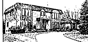
BLOOMFIELD HILLS! Freshly painted interior. Beautiful lot with circular driveway. Kitchen with island opens to 23x19 Family Room. Second kitchen and wet bar in basement with high ceiling. $350,000 (ED-H-26WOO) B10730 Call 646-1400.