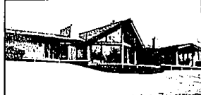
WESTERN STYLE RANCH. Open and inviting, this impressive home offers dramatic beamed cathedral ceilings, fieldstone walls & fireplaces, built-ins galore, an awe-inspiring master suite, wrap-around decking. $520,000 (ED-C-50REB) Call 625-9300.