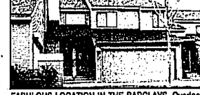
FABULOUS LOCATION IN THE BARCLAYS. Overlooks quiet commons area. Two bedrooms, two and one-half baths. Loft overlooks great room. Soft, contemporary decor. $114,500 (ED-H-27ASH) Call 646-1400.