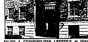
ENJOY A COSMOPOLITAN LIFESTYLE at Victoria Place in downtown Birmingham! A surprise awaits inside this renovated 1920's building! Available deluxe. $99,500 to $168,000. (ED-B-275OU) B10621 Call 644-6700.