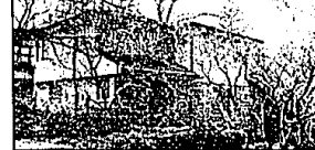
INTOWN BIRMINGHAM. Beautifully updated. Large deck overlooking the gardens & landscaping. Newer furnace, central air & hot water heater. Newer kitchen. Three bedrooms, 2 baths. $279,900 (ED-H-91GOR) Call 646-1400.