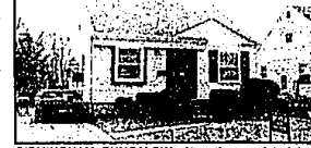
BIRMINGHAM BUNGALOW. Attractive, updated bungalow within walking distance from downtown Birmingham features 3 bedrooms including large master bedroom, and basement. $105,000 (ED-B-98BIR) B10832 Call 644-6700.