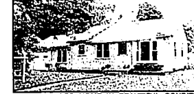
IDEAL STARTER HOME in BEAUTIFUL CONDITION with a great location - Floral Park of Farmington. 1990-new quality windows plus a bay. 1989-new shingles and vents, 1992-new kitchen floor. $79,900 (ED-W-22FLO) B11783 Call 626-4000.