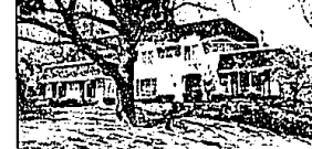
FABULOUS FRANKLIN FAMILY COLONIAL. This beautiful home features rolling landscaping, 5 bedrooms, 3 1/2 baths, and finished walk-out lower level. $389,790 (ED-W-60GRE) B12154 Call 626-4000.