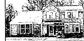
WEST BLOOMFIELD FAMILY COLONIAL. Large 4 bedroom home with spacious open floor plan. A premium wooded lot, and a circular drive. $177,500 (ED-W-08POP) B12157 Call 626-4000