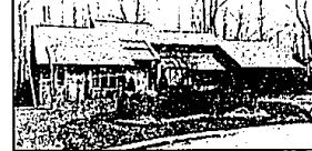
OUTSTANDING MAPLEWOODS CONTEMPORARY. Private wooded lot - quiet cul-de-sac setting. Large tiled foyer, vaulted ceilings, floor to ceiling fireplace, huge kitchen with beautiful natural wood floor. $348,000 (ED-H-02PIC) B08981 Call 646-1400.