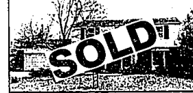
GREAT FAMILY HOME in Poppleton Park is totally redone. Neutral tones, wood floors, central air. Great large yard. $325,000 (ED-B-00WIM) B11545 Call 644-6700.