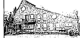
CASS LAKE - WEST BLOOMFIELD. Three story contemporary with quality personified. Lake frontage plus canal frontage. Features 2, two room bedroom suites. Third level an artist would die for. $529,000 (ED-W-33WIN) B12277 Call 626-4000.