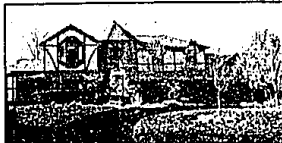
BLOOMFIELD HILLS ESTATE On a private setting. Approx. 7,600 sq. ft. Unique blend of traditional elegance with contemporary styling. Two master suites, library, 6 bedrooms, 5 full, 2 half baths. $995,000 (ED-H-26BAL) B07390 Call 646-1400.