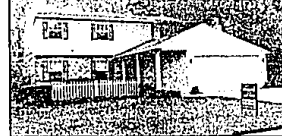
FANTASTIC CONDITION. Clean, well decorated Troy Colonial in active and friendly neighborhood. Four bedrooms, 2.5 baths, family room with fireplace, first floor laundry, central air, new carpet. $145,800 (ED-B-48HG) B12591 Call 644-6700.