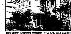
PERFECT INTOWN CONDO. The only unit available at Birmingham Court Condominiums. Two bedrooms, 2.5 baths, one carport. Optional finished basement. $144,900. Also available for lease at $1,275 per mo. (ED-B-55WOO) B12767 Call 644-6700.