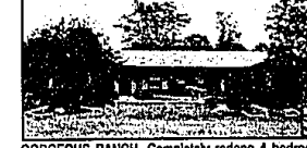
GORGEOUS RANCH. Completely redone 4 bedroom, 1 1/2 bath ranch, newer roof, deck, beautiful white kitchen, ceramic foyer, fireplaces in living room and family room, 2 furnaces, Meadowlake privileges. $289,500 (ED-H-31INK) B12638 Call 644-1400.