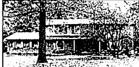
POPULAR HICKORY HEIGHTS. Move your family into this 5 or 6 bedroom Colonial with hardwood floors throughout. Absolutely beautiful tree lot with lovely landscaping. $325,900 (ED-H-39HAW) B12436 Call 644-6700.