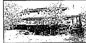
CASS LAKE FRONTAGE. Fabulous top notch contemporary with vaulted ceilings. Sloping private lot to lake. Walkout finished lower level. Pool. Five bedrooms, 3 full and 2 half baths. $655,000 (ED-H-451SL) Call 644-6700.