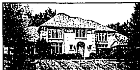
MAGNIFICENT FRENCH MANOR HOME IN THE CITY OF BLOOMFIELD HILLS. Outstanding lot with private rear yard. $799,000 (ED-H-30CBE) Call 646-1400.