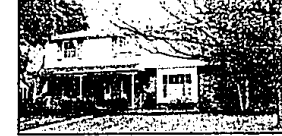
PRIME BLOOMFIELD VILLAGE LOCATION. Classic center entrance Colonial home in mint condition. Newer furnace; central air, hot water heater and garage door opener. Birmingham Schools. $345,900 (ED-H-27WIL) Call 646-1400.