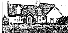
VERY WELL MAINTAINED and neat Cape Cod with all the charm and decor for the country dweller. Easy access to shopping and the Rochester school district. $239,000 (ED-R-40LAN) 106105 Call 656-6500.