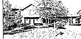
OUTSTANDING 4 BEDROOM, 2 1/2 bath custom contemporary. Spacious ceramic entry. Bridge overlooks great room. Library, gourmet kitchen, finished lower level. Central air, Deck. Beautifully landscaped. $263,500 (ED-W-96DEE) B12149 Call 626-4000.