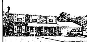
PLEASANT RIDGE COLONIAL. Wonderful Colonial in prestigious Pleasant Ridge. Excellent floor plan. Spacious rooms, large foyer, formal dining room. $150,000 (ED-B-25MIL) B12552 Call 644-6700.