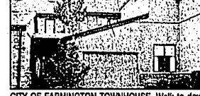
CITY OF FARMINGTON TOWNHOUSE. Walk to downtown from this clean, 2 bedroom, 2.5 bath home. Extras include attached garage, 1st floor laundry, finished basement, some hardwood floors. $112,900 (ED-W-39FAR) B10587 Call 626-4000.