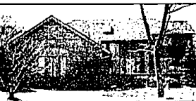
BIRMINGHAM CONTEMPORARY Walk to downtown from this newly new home featuring a spacious great room, gourmet kitchen and luxurious master suite with jacuzzi. $349,900.