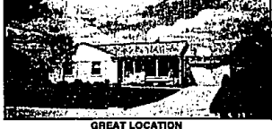
GREAT LOCATION Bright, cheerful ranch backs to commons, trees and pond for maximum privacy. 3 bedrooms, 1.5 baths, super kitchen, full basement, custom deck. Only $118,000. Call 646-5000 (05DOL).