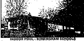
INDOOR POOL - BIRMINGHAM SCHOOLS Custom designed and built 3-4 bedroom, 2.5 bath quad features an indoor 20x40 pool, great for entertaining and year-round fun. Almost .5 acre lot. $223,900. Call LARRY BANGHART, 646-5000.