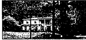
WILLIAMSBURG COLONIAL Two story entry, authentic detailing, 5 bedrooms, 3 full and 2 half baths, library, spectacular wooded private lot. Prestigious Bloomfield Hills location. $549,000. Call ALICE RUTTEN, 646-5000.