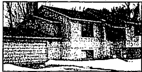
FUN HOUSE! Spacious rooms are perfect for entertaining. Marble fireplace adds charm. 2 bedrooms and 1 bath are finished. 3rd room and a full bath roughed and ready for your designer flair. Farmington Hills. $127,500!