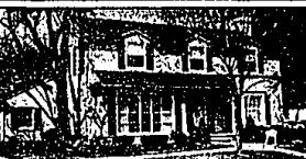
BLOOMFIELD VILLAGE Meticulously maintained family home with 27x15 family room addition, library and formal living room. $349,000.