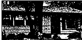
MICHIGAN READY! Royal Oak ranch is ready for anything. Extra insulation, 90% efficient furnace, AND central air! Updated 3 bedroom has extra 1/2 bath in finished basement. Fresh paint. Beautiful lot. $81,900!