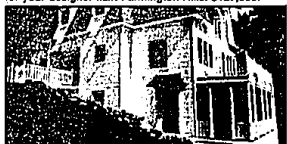
POSTCARD VIEW! One look will tell you why the house was built on this site! Lake Orion lakelot! 3 bedroom, 3.5 bath, re-tiled and enhanced for today's lifestyle. Comfortable yet stylish with designer detail throughout. $349,900!