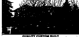
QUALITY CUSTOM BUILT contemporary with 4 bedrooms, 2 full and 2 half baths. Chef's delight kitchen, great room with studio ceiling, picturesque landscaping. $419,000. Call JOAN PARK, 646-5000.