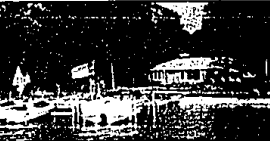
ORCHARD LAKE FRONTAGE! Suitable for expansion or a mission. East shore - unsurpassed sunsets, sandy bottom. 3 bedrooms, 2.5 baths, 3 car garage, dock, jacuzzi, approximately .75 acre. W. Bloomfield schools. $424,900. (B05150)