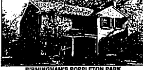
BIRMINGHAM'S POPPLETON PARK Classic New England four bedroom colonial. Large family room, finished basement. Well priced at $279,000. Call FORREST REED, 646-5000 ext. 225.