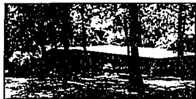
BLOOMFIELD HILLS SCHOOLS Contemporary with white Euro kitchen with convection oven. Frontage on small lake. Family neighborhood. $299,500.