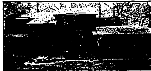
PRIVATE WOODED SETTING Cul-de-sac location, chef's delight kitchen. Family room with foldstone fireplace and skylights. Finished walk-out lower level. 4 bedrooms, 2.5 baths. $339,000. Call JOAN PARK, 646-5000.