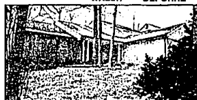
UPPER STRAITS Lake privileges, boat ramp, 3 bedroom contemporary with loft and finished basement. $249,900.