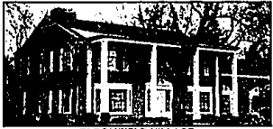
BLOOMFIELD VILLAGE Architectural landmark 5 bedroom home with 9 ft. ceilings. Grand foyer, sculptural staircase, banquet size dining room, one-half acre lot. $550,000. Call BEVERLY CLEMO, 646-5000 or 258-2492.