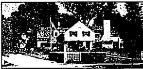
CHARM & ELEGANCE This lovely Bloomfield Village home is just waiting for the discriminating buyer! 6 bedrooms, 4 baths, 3 car garage, close to Cranbrook. Beautiful views. Call DEE ALAIMO, 646-5000, ext. 237.