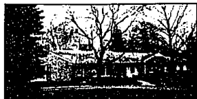
CITY OF BLOOMFIELD HILLS Gracious yet comfortable showplace. Magnificent cherry kitchen, huge custom master bath. Charming brick walkways. $492,000.