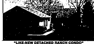
"LIKE-NEW DETACHED RANCH CONDO" 3 bedrooms, 2.5 baths, den. Cathedral ceilings, dynamic master suite, library, 2 fireplaces, lake privileges. Terms considered. $279,000. Call ALICE RUTTEN, 646-5000.