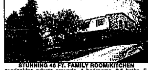
STUNNING 46 FT. FAMILY ROOM/KITCHEN overlooking private grounds. 4 bedrooms, 2.5 baths, library. Newer decor, furnace, for conditioning, roof, kitchen. Bloomfield Hills schools. $246,800. Call ALICE RUTTEN, 646-5000 or 644-2983.