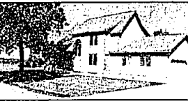
ALL SPORTS WALLED LAKE IN NOVI 75 ft. frontage, 3 bedrooms, 3 baths, 1st floor bedroom with bath, 2nd floor master adjoins full bath. Kitchen with island. 2nd floor laundry, 3 car garage. $259,900. (B12128)