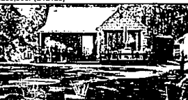
ALL SPORTS LOWER STRAITS LAKEFRONT In Commerce. Needs renovating, but priced to sell. Cottage or year-round home. 40 ft. of frontage, 2 bedrooms, 1 bath, 1.5 car attached garage. Deck. $119,900. (B11882)

Quality homes in: Birmingham • Bloomfield Hills Rochester • Farmington Hills Troy • West Bloomfield