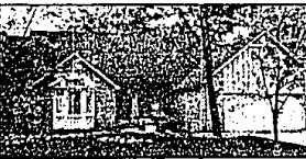
FIRST FLOOR MASTER SUITE Stunning vaulted ceiling great room in this better than new W. Bloomfield home with many upgrades including a premium lot. $235,000.