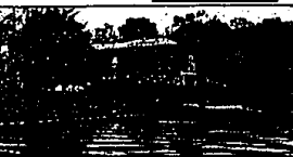
ORCHARD LAKEFRONT! 3 bedrooms, 3 baths, 3600 sq. ft. on .75 acre with 75 ft. frontage. Master suite with fireplace & doorwall overlooking lake. Kitchen with 10 ft. island. Central air. $485,000. (B10422)