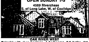
OPEN SUNDAY 1-5 4569 Riverchase S. of Long Lake, W. of Coolidge Colonial with river frontage, 4 bedrooms, 3.5 baths, 1st floor master suite, living room & master bedroom overlook river. Walkout lower level. $475,000. Call JIM LEAHY, 646-5000.