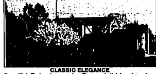
CLASSIC ELEGANCE Beautiful Tudor in popular Troy subdivision has four bedrooms, library, 1st floor laundry. Trees and flower gardens. $189,500. Call 646-5000 (12HER).