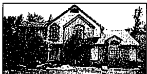
PERFECT PACKAGE Four bedroom contemporary built in 1980, professionally decorated in neutrals. French doors to rear deck. $239,900.