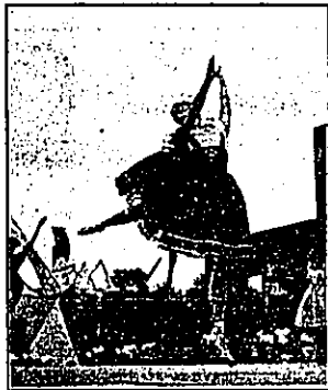
ART IN PARK —Music and fine art performances are featured during the festival's Sunday in the Park with Art event.

For more information or to receive a Three Rivers Festival Program Brochure, call (219) 745-FEST.