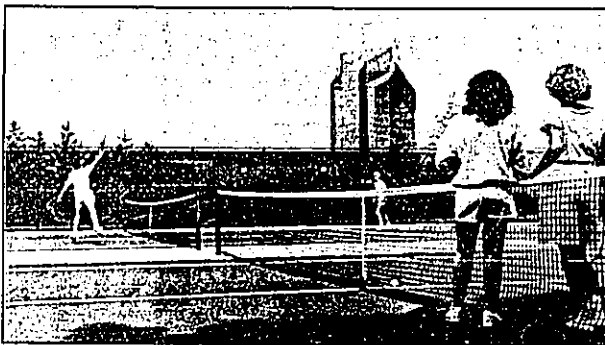
ACE RESORT— The host of summer activities available at Grand Traverse Resort include outdoor tennis.

Days and nights filled with sun, fun, and plenty of things to do, make the best of all seasons, even better. For more information about events, activities, golf and family vacation packages call Grand Traverse Resort at 1-800-748-0303.