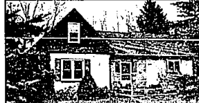
SHARP SOUTHFIELD BUNGALOW on lovely treed setting backing to golf course. Sandstone fireplace in living room, three bedrooms, two baths. Hardwood floors. Basement. All new Andersen windows. $85,000. (644-6300) B11355