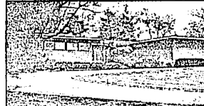
A CHANCE TO OWN AN ORIGINAL Yamassee designed home in the City of Bloomfield Hills. Functional, quiet elegance and many features. Library, five bedrooms, four baths, beautiful pool and more. (644-6300) B12998