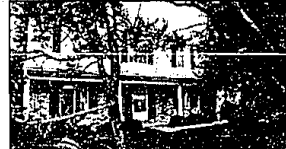
LARGE CORNER LOT in great family neighborhood. Neutral decor. Nice patio overlooking landscaped yard. Large breakfast room plus separate dining room great for entertaining. 3 bedrooms. $86,900. (651-5500) B12915