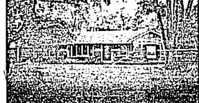
EXPANSIVE BLOOMFIELD HILLS RANCH has Wing Lake privileges. Great room, library, family room, three bedrooms, three baths, central air. Extensive updating with many mirrors. $254,000. (644-6300) B12863