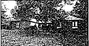
A VERY SPECIAL SETTING overlooking woods. This bright and airy three bedroom, 3 1/2 bath ranch has flexible open floor plan. Large breakfast room, 1st floor laundry, finished walk-out lower level. $239,900. (644-6300) B11714