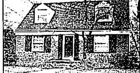
ARCHITECT'S OWN HOME in Birmingham with much updating offers separate dining room, high ceiling family room with fireplace, recently finished rec room, large deck, dormers - It's a honey! $138,900. (644-6300) B11331