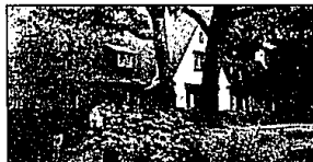
LOCATION, LOCATION, LOCATION - Wooded privacy, lovely gardens and history surrounds this former gardener's cottage in City of Bloomfield Hills. Child's dream with a cow barn and old milkhouse. $425,900. (644-6300) B09189