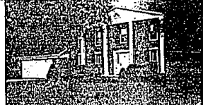
CHICHESTER SUB. Colonial backing to wooded rear yard. 4 bedrooms, 2 1/2 baths, family room fireplace, French doors leading to very nice private deck. Dining room and kitchen with bay windows. Rochester. $189,600. (651-3500)