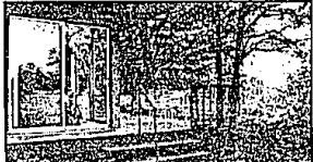
ONE OF BIRMINGHAM'S HIGHEST, most secluded sites of over an acre with a spectacular view of Linden Park and the sunsets over the Rouge River Valley. Unique, charming home. 3 bedrooms. $325,000. (644-6300) B07084