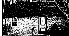
CONVENIENT AND POPULAR LOCATION for this fine Troy townhouse with a newer kitchen. Two bedrooms, both with walk-in closets, 2 1/2 baths, all appliances including washer and dryer. Two carports. $89,500. (644-6300) B09419