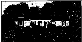
CITY OF BLOOMFIELD HILLS lovely ranch on a beautiful acre. Elegant marble foyer, newer kitchen, library, family room fireplace, three bedrooms and 2 1/2 baths. Tranquil views from most of the rooms. (644-6300)