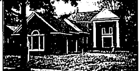
BIRMINGHAM ELEGANCE. This brand new residence is in the Barton Lake/Holy Name area. Magnificent 18' foyer, library, 4 bedrooms. Great for formal entertaining yet comfortable for family living. (644-6300) B12617