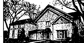
IN-TOWN BIRMINGHAM newer construction with redwood siding and cedar shake roof, open floor plan, hardwood floors in main level, large foyer with French doors to library, marble fireplace in family room. $449,900. (644-6300) B11433