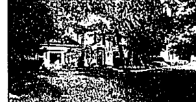
BLOOMFIELD HILLS CUSTOM COLONIAL on beautifully landscaped private site with pool. 2-story marble foyer, grand staircase, wonderful floor plan great for entertaining. 1st floor master suite. $449,900. (644-6300)