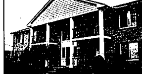
WHY RENT when you can own this great condo in a convenient location? Neat and clean storage in private basement with laundry area. Central air, VA and FHA terms available. Carpet. $39,900. (644-6300) B11358