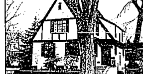
CHARMING STUCCO TUDOR on oversized lot. Living room with fireplace, formal dining room with built-ins, cherry cabinets in updated kitchen. 3 bedrooms. Family room opens to deck. Birmingham Schools. $174,900. (644-6300)