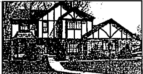
PREMIUM TREED LOT. 4 bedroom colonial offering 1st floor laundry, library/study, breakfast room, family room with fireplace. Deck, outside lights, central air and more. Rochester. $199,500. (651-3500) 107317