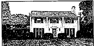
NEAR CRANBROOK Beautiful lawn and pool. Hardwood floors in formal dining room, large kitchen and living room with lovely imported fireplace, delightful master suite, family room plus Florida room. $659,000 B-12395