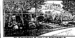
BLOOMFIELD HILLS SCHOOLS Custom quality walk-out ranch with great open floor plan. Great room, white Formica kitchen, large finished walk-out level. Beautifully landscaped. Family room plus library. $379,900 B-12831