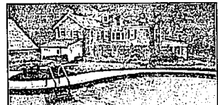
CITY OF BLOOMFIELD HILLS Gracious country estate with beautiful grounds of over 3 acres accentuated with flower gardens, mature trees, brick walks and pathways. Four car garage, 5-7 bedrooms, 5 fireplaces, 4 1/2 baths. $2,475,000 B-09440