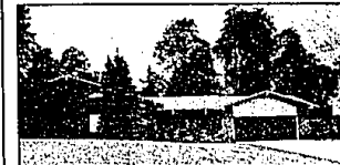
LAKE PRIVILEGES Custom built on a private treed 3/4 acre lot. Wet bar. Pella windows, zoned heating, central vacuum, wet bar, 2 master suites. Beautiful deck and landscaping. $225,000 B-12143