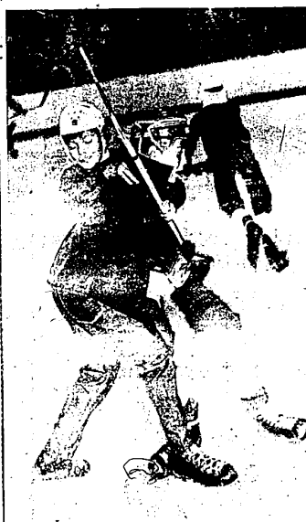
FOR PUCK, just like the pros, are who is holding off Tom Cleary.