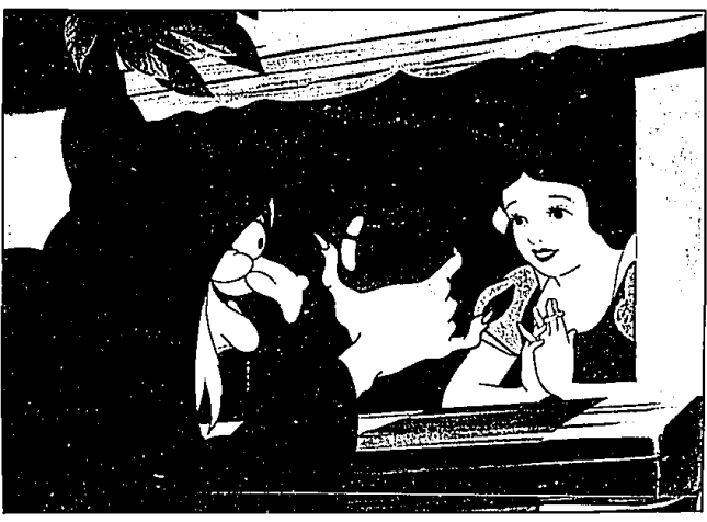
THE WALT DISNEY CO.