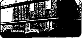
TROY. Excellent end unit Condo. Features 2 master suites, private garden patio, finished basement and sparkling neutral interior. Move-in condition. All kitchen appliances included. Convenient location for professionals on the go. $84,900 689-8900 05-A-7842