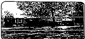
ROCHESTER HILLS. Spacious 4 bedroom home on a large lot. Beautiful wood flooring in living room with fireplace. Ceramic entry in lower level with large family room with another lovely fireplace. Doorwalk to outstanding deck. $142,900 651-8850 04-A-7600