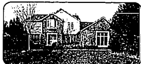
ROCHESTER HILLS. Designed for entertaining! This custom home was planned for an active lifestyle. Spectacular 2-story great room. Beautifully finished walk-out with bedroom, bath and sauna. Three car garage. On the commons. $284,900 651-8850