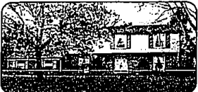
NORTHVILLE. Absolutely wonderful 4 bedroom home in a well-established neighborhood. Beautiful screened porch with skylights. New siding and trim, central air, brick walk. Newer kitchen appliances, roof shingles and more. $237,500 626-9100 02-D-8130