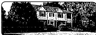
LAKEFRONT. Private peninsula on Lake Sherwood, shared with only 3 homes. 300' plus frontage. New kitchen, baths and furnace. Solarium. Breakfast room, large patio on lake off family room. Wet bar and fireplace. Three to four bedrooms, 2 baths, attached garage. A very rare and private piece of property. $405,000 683-8900 06-B-8329