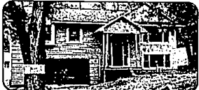
WATERFORD. Cass Lake privileges! This new home offers 3 bedrooms, 2 1/2 baths, fireplace, 2 car garage and quality throughout. Master bedroom with walk-in closet. Wood windows. Dining and family rooms. Finished basement. $117,900 683-8900 06-B-8331