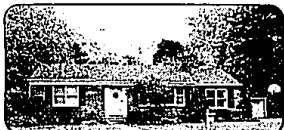
BIRMINGHAM. Beautifully maintained home within walking distance to downtown. Spacious living room with fireplace. Huge dining room. Two full updated baths. Library could be 4th bedroom or office. Large deck off family room. $184,900 646-6000 01-A-8180