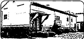
NOVI. Charming 2 bedroom and unit Condo. Overlooks serene wooded area. Custom shutters, track lighting, cathedral ceilings and fans. First floor laundry. Pool, tennis court and clubhouse. Low heating bills. A rare find! $92,900 626-9100