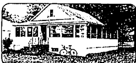
WEST BLOOMFIELD LAKEFRONT. Great investment property on Middle Strals Lake. This home offers 78 feet of frontage. Two bedrooms, bath, 2 car garage. Area of $300,000-plus homes. Beautiful views! Just offered at $164,900 683-8900 06-B-8330