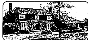
MILLFORD. Majestic 4 bedroom home in an exclusive sub. Large 2-story foyer, oak floors, crown moldings and stained woodwork. Year-round sun room. Three fireplaces including one in the master bedroom. Walk-out lower level. Must see. $349,500 626-9100