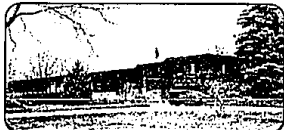
BIRMINGHAM. Sharp 4 bedroom Contemporary with many updates. Open foyer, spacious chef's kitchen, large living room and formal dining room. Romantic master suite with fireplace. Deck overlooks in-ground pool. Circular drive. $204,000 626-9100