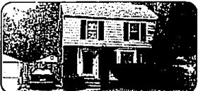
BERKLEY. Very special 3 bedroom, 2 bath home in great condition and a great location! Neutral decor, living room with fireplace, formal dining room and finished basement. Security system and central air. Lovely, private back yard. $109,900 651-8850