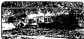
BIRMINGHAM. Terrific 3 bedroom, 2 1/2 bath home. Large living room with fireplace, separate dining room and family room overlooking a private fenced yard. Carpeted basement with fireplace. Customized master bedroom. Updated kitchen. $239,000 646-6000