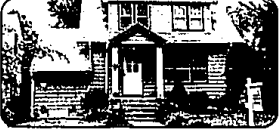
BLOOMFIELD. Charming 3 bedroom Cape Cod. Updated bath with new tile. Hardwood floors throughout. Wood burning stove, Square Lake privileges, wet plaster construction and 1st floor bedroom. Deck, grape arbor and flowering plants. $68,800 683-8900