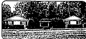
BLOOMFIELD. Traditional brick Ranch on a large, tranquil, treed lot in a prime area. This home features a large, enclosed porch, 3 fireplaces, wet bar, library, rec room and side-turned 2 car garage. Newer furnace and air. $379,900 626-9100 02-B-8254