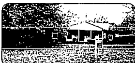
WEST BLOOMFIELD. Freshly decorated 3 bedroom Ranch with lake privileges and private beach on Hammond Lake! Large sunroom open to formal dining room. Too many updates to list! Two fireplaces, fenced yard, finished basement. $134,500 626-9100