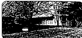
BLOOMFIELD. Excellent Contemporary with Walnut Lake privileges. Huge master bedroom suite addition. Three additional bedrooms, 3 1/2 baths, 2 fireplaces, finished walk-out lower level and library. Newer sauna. Birmingham schools. $339,900 626-9100 02-B-8232