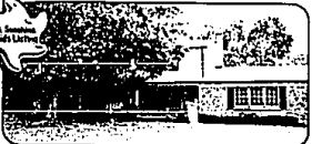
FARMINGTON HILLS. Spacious Colonial in desirable Kimberley. Best buy for square footage. Master suite with dressing area and walk-in closet. Hardwood floors, 1st floor laundry, deck with privacy fence. Walk to schools. Home warranty! $157,900 626-9100