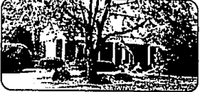
TROY. Charming, bright and well cared for 4 bedroom home! Brand new oak kitchen! Beautiful decor. Fireplace with custom mantle. Newer carpeting in living, dining and family rooms. New siding. Newer central air and roof. $126,900 689-8900 05-A-8326