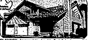
CLAWSON. Immaculate, hard-to-find 2 bedroom, 2 1/2 bath Condo. Ideal location. Clean, neutral decor, cathedral ceiling, fireplace and more. Finished basement, dining room and attached garage. All appliances stay. Quick possession. $97,900 689-8900