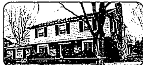
BIRMINGHAM. Bloomfield Village 4 bedroom home. Very private lot with heated in-ground pool. Updated kitchen. Newer sprinkler system. Lots of hardwood floors. Two full, 2 half baths. Nice rec room. Family room and formal dining room. $339,900 626-9100