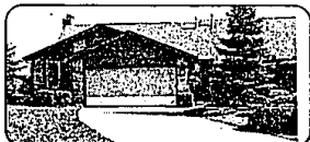
OPEN SUN. 2-5, 968 Greenview Ct., SE corner of Livernois and Tenken. ROCHESTER HILLS. End-unit overlooks 14th green of Great Oaks C.C. Three bedrooms, 3 full baths. Finished walk-out, over 3000 sq. ft., 2 fireplaces. $193,000 651-8850 04-A-8177