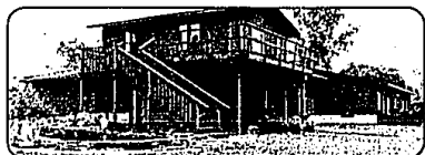
BLOOMFIELD. Very well maintained 4 bedroom Colonial on the back of 4-plus acres - buildable 4-5 total! This neutral home offers over 2800 sq. ft., 2 full, 2 half baths, library, dining room, family room and more. Central air, security system. Attached and detached garages and polo barn. $425,000 646-6000 01-A-8321