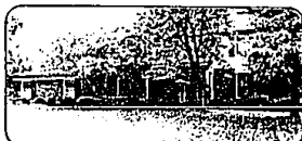
FARMINGTON HILLS. The best! Thoroughly updated 4 bedroom Colonial. Newly extended kitchen with all the extras. Library, dining room, finished basement and family room with fireplace. Heated in-ground pool! Private treed yard. $198,500 626-9100 02-B-8323