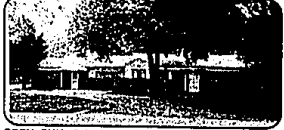
OPEN SUN. 2-4, 19741 Saxton, N. of 8 Mile, E. of Evergreen. SOUTHFIELD. Car lovers delight! Two/ three bedroom, 2 bath Ranch with 7 car attached garage, 2050 sq. ft. Large living and dining room. Two fireplaces, beautiful large lot. $89,900 683-8900