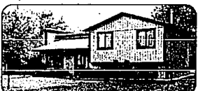
WALLED LAKE. Beautifully decorated 3 bedroom Tri-level! Bright kitchen with oak cabinets and new floor. New living room carpet. Nice deck and patio overlooking well-landscaped yard. Award-winning elementary school across the street! $129,900 626-9100