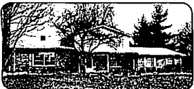
BLOOMFIELD. Completely redone 4 bedroom home. Offers many fine features. Fourth bedroom could be library. Family room with fireplace, dining room, 2 1/2 baths and a 2 car attached garage. Central air. Great location in a quiet area. $189,900 689-8900 05-B-7999