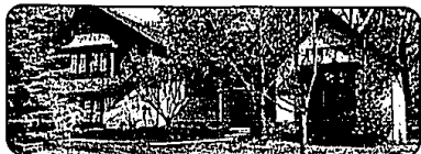
BLOOMFIELD. Smashing! Very upscale and transitional floor plan. Redone in neutrals. Two-story foyer. Tray ceiling in great room. Quality throughout. New white Woodmode kitchen with Corian countertops. Hardwood floors, wood windows, doorways open to extensive decking. Open, light and airy! Birmingham schools. $545,000 646-6000 01-B-7745