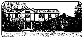
TROY. Custom-built elegance! Tons of extra features: 2-story foyer, skylights, vaulted ceilings, 3 fireplaces, oak floors. One-of-a-kind master bedroom suite with separate dressing room and walk-in closets. Great sub. $254,900 689-8900 05-A-7993