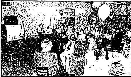
Ballroom potatoes: More than 200 people gathered at Farmington Hills' Botsford Inn to watch the first episode of the show.