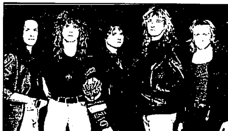
Going strong: Fans are still eager for the sound of Def Leppard — Vivian Campbell (from left), Rick Savage, Rick Allen, Joe Elliott and Phil Collen.

Def Leppard and Ugly Kid Joe perform at 7:30 p.m. Friday, July 23, Pine Knob Music Theatre, 1-75 and Sashabaw Road, Clarkston. Tickets are $22.50 pavilion or $20 lawn. For more information, call 377-0100 or 645-6666.