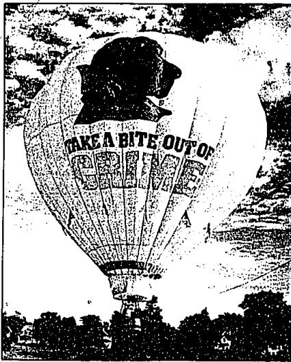
Not just a lot of hot air: The McGruff the crime dog hot air balloon will be at the National Night Out celebration in Farmington Hills Aug. 3. The event begins at 6 p.m. at the Alexander Hamilton Insurance Co. in Farmington Hills.