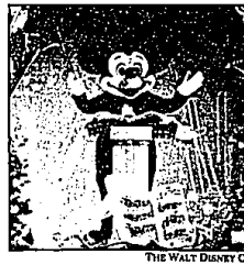
THE WALT DISNEY CO.

"Little kids can hear an orchestra, and adults can hear the cartoon tunes they remember from childhood," said Monaco.