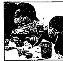
See FUN, 18A

Metrobank staff will be available to register children for their innovative banking program called "Moola,