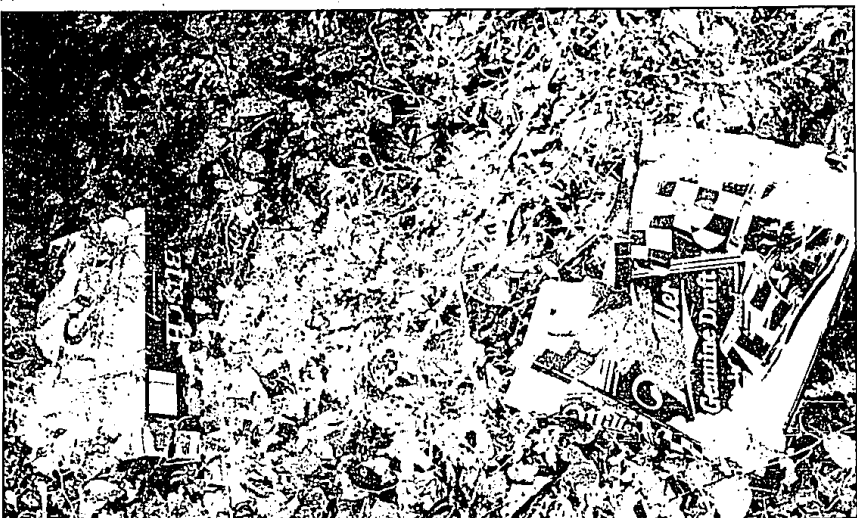
Evidence of drinking? Beer case boxes (above) were tossed in the bushes off the Farmington path. The path (right) connects ends of Oakland Street in Farmington. The two circular concrete patches show where the barriers stood.