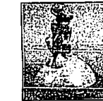
Marshall Fredericks, (American, b. 1908) bronze, "Baby Balcony (self-portrait)", 11" h., signed

Call for free illustrated brochure Catalogues $20.00, $25.00 postpaid, $35.00 foreign 420 Enterprise Court, Bloomfield Hills, MI 48302 (three blocks north of Square Lake Road, east off Franklin)