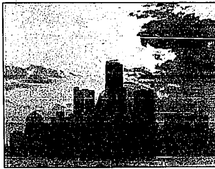
Cityscape: Late afternoon backlighting produced a striking silhouette of Detroit's skyline for Monte Nagler's camera. The unusual "pyramid" composition was achieved from a vantage point in Windsor.

Explore behind the scenes... up narrow alleys or behind a row of houses. You may think at first that such things would be unphotogenic, but with careful framing they may convey the feel of a city better than the famous buildings. In the end, it's usually the heart of the city that enables you to