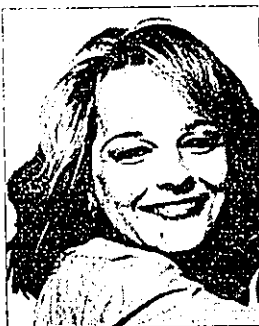
Thursday on NBC's "Mad About You," Jamie (Helen Hunt) brings home a new client.