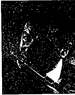
James Galway is featured in the first episode of "Concerto," Monday on The Learning Channel.