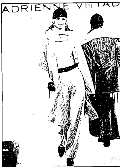
The new knits: Knits are coming on strong for fall. Easy and loose, wool blend camel heather cardigan coat ($370) with layering piece ($98), pant ($220) and scarf ($95). At Adrienne Vittadini, The Somerset Collection, Troy.