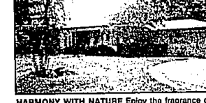
HARMONY WITH NATURE Enjoy the fragrance of pine on this rolling and wooded 2.55 acres. Fruit trees line the driveway of this 3 bedroom, 2.5 bath brick Ranch located in Oakland Township. Well maintained home. $184,500 (30WEY) 652-8000