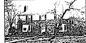
ABSOLUTELY CHARMING 3300 sq. ft. Fieldstone Colonial with never white formica kitchen. Huge formal living room and dining room. Spacious master bedroom suite, double stairwells. $409,900 (86GLE) 642-8100