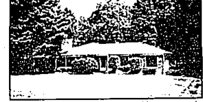
UNBELIEVABLE RAVINE SETTING, 1.3 acre in secluded area. 4 bedroom, 2 bath ranch with a great room that opens to 4 tiers of dock, hardwood floors, 3 car garage, dual furnace, 2625 sq. ft. $229,900 (85COL) 642-8100