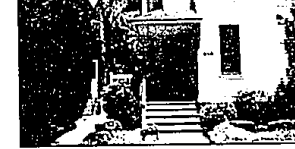
FABULOUS, in town Finnicum designed townhouse, 2 story and unit. Antique front door with leaded glass done by Peacock Alley. Neutral decor, private courtyard and deck, open floor plan. $274,900 (08BRO) 642-8100