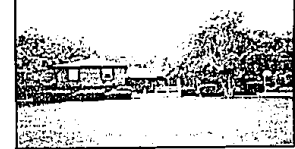
LAKE PRIVILEGES. Quad on absolutely fabulous 1/4+ acre setting in Bloomfield. Renovated elevation, up dated kitchen, huge master bedroom suite with unbelievable closet and built-ins, Florida room and finished basement. $239,900 (18MAL) 642-8100