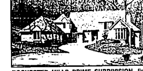
ROCHESTER HILLS PRIME SUBDIVISION, first floor master with bath, sun room, finished walk-out lower level, 2 staircases, security, kitchen with Corian white cabinets, Jenn Aire appliances, 3 car garage, cul-de-sac lot. $379,000 (80CRO) 652-8000