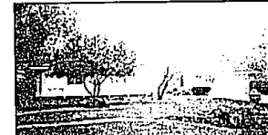
HARD TO FIND 3 bedroom, 2 1/2 bath ranch with 2200 sq. ft. in updated condition. New windows, new roof, terrific yard and great master bedroom suite. Great condition! $189,900 (75COU) 642-8100