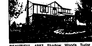
BEAUTIFUL 1987 Shadow Woods Tudor in Rochester Hills. Offering 4 bedrooms, 2 1/2 baths, first floor laundry, wet bar in family room, sprinklers, air and much more. Priced for quick sale. $193,600 (89STE) 652-8000