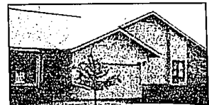
LAKE ORION. Condo like style. Built in '88. Skylight, wood windows, deck off living room, lake privileges. Pets are welcome. Near I-75, finished lower level. $113,900 (67HUN) 524-1600