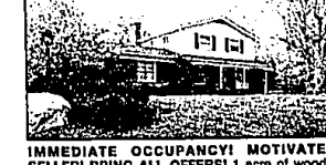
IMMEDIATE OCCUPANCY! MOTIVATED SELLER! BRING ALL OFFERS! 1 acre of woods, classic colonial with 3/4 bedrooms, 2.5 baths, 20x25 recreation/sun room. Family room, fireplace, oak cabinetry. $184,000 (53WIM) 652-8000

4820 Rochester Rd. Troy, MI 48098 524-1600 Hrs.: Weekdays 9-9 Weekends 9-5