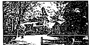
BLOOMFIELD HILLS. 3 bedroom Tri-Level located on all sports lake offers 2 1/2 baths, first floor laundry, 2 fireplaces, heated Florida room with view of lake, dock, 24x24 garage. $389,900 (21LON) 524-1600