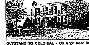
OUTSTANDING COLONIAL - On large tree lot. Open floor plan and neutral decor. Features living room, dining room, family room, fireplace, sun porch, 4 bedrooms, 2.5 baths. Master suite, central air and more! $172,500 (28BRN) 652-8000