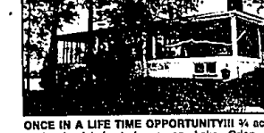
ONCE IN A LIFE TIME OPPORTUNITY!!! 1/4 acre peninsula lakefront home on Lake Orion. 5 bedrooms, 4 fireplaces, porch, walk-out, concrete seawall, boat dock. Additional vacant lot with boat house available. $379,900 (20AND) 652-8000