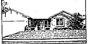
TROY. Semi custom 4 year old Ranch with 3 bedrooms, 2 1/2 baths. Open floor plan, kitchen open to greatroom. Oak floors, first floor laundry, library, security system, central air. Many updates. $189,900 (07BLO) 524-1600