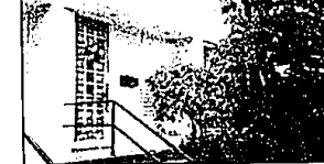
EXCITING open Contemporary Intown Birmingham condo with high ceilings, 3 bedrooms, 2 1/2 baths, loft, den, private courtyard, outstanding condo living! $269,000 (66BRO) 642-8100