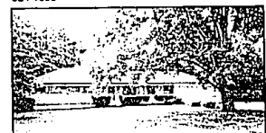
TROY. Park like setting! Over 1/2 acre. Open floor plan, fresh paint, new beige carpet throughout. New roof and gutters '93. Screened in porch. $124,900 (70EBL) 524-1600