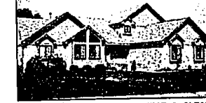
WOW! NEARLY NEW (1990) NEAT & CLEAN! Great room 2 story, master bedroom on main floor plus formal dining room, first floor laundry, deck, central air, security system, side entry garage and library. $182,000 (26WIL) 652-8000