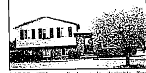
LARGE 1700 sq. ft. home in desirable Troy location features many newer items, new roof, air conditioning, trim and gutters. Freshly painted with 2 1/2 car garage and fenced yard. $114,900 (93PAS) 642-8100