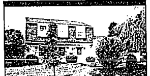
TROY. Decorator perfect inside and out. Freshly redecorated within previous 4 years, features 3 bedrooms, 2 1/2 baths and 15x22 family room and side entrance garage. $118,900 (69REN) 524-1600