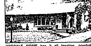
UPSCALE HOME has it all...location, comfort, privacy and space. Room for entertaining and cozy retreats. Master bedroom opens to private deck. Must see to appreciate! $198,900 (72PLE) 642-8100