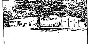
BLOOMFIELD TOWNSHIP. Beautifully maintained home inside and out on 1.2 acre lot. In-law quarters, furnace 2 years, shingles one year. One year Home Warranty. More! $250,000 (65DOW) 524-1600