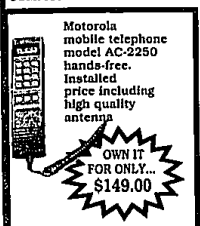
Motorola mobile telephone model AC-2250 hands-free. Installed price including high quality antenna