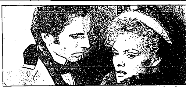
Elegant setting: Michelle Pfeiffer (right) stars as Countess Ellen Olenska and Daniel Day-Lewis as Newland Archer in "The Age of Innocence." Enter our contest by sending us a color picture of your most elegant table setting.

"Cool Runnings" is rated PG (Parental Guidance suggested, some material may be inappropriate for pre-teens) and opens Friday at these suburban movie theaters: AMC Abbey, AMC Laurel Park, AMC Old Orchard, AMC Southfield City, AMC Sterling Center, General Cinema Canton, Showcase Auburn Hills, Showcase Dearborn, Showcase Pontiac, Showcase Sterling Heights, Showcase Westland, Star Rochester, United Artists 12 Oaks.