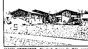
MANY UPGRADES. Neutral decor in this great room ranch with beamed cathedral ceiling, 3 French doors to 540 sq. ft. deck, fireplace, bow window in dining room and bay in kitchen eating area. Very well cared for. $144,900. (689-7300)