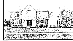
BUILDER'S MODEL with all the extras! Library with oak paneling and built-in desk, kitchen, library and foyer with hardwood floor. Professionally landscaped, sprinklers, alarm system. Shelby. $296,900. (651-3500) 108355