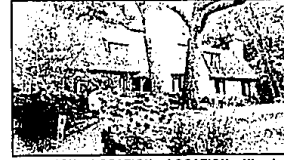
LOCATION, LOCATION, LOCATION. Wooded privacy, lovely gardens and history surrounds this former gardener's cottage in City of Bloomfield Hills. A child's dream with a cow barn and old milkhouse. $419,000. (644-6300)