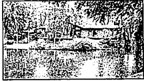
RARE FOREST LAKE FRONTAGE! Swimming, fishing, boating and skating at your doorstep. Captivating views from most rooms. Vaulted ceilings, recessed lighting, glass walls. Very prestigious location. (644-6300) B13867