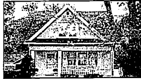
WONDERFUL IN-TOWN BIRMINGHAM HOME close to shopping. Three bedrooms, dining room, 1st floor laundry, basement, newer furnace and central air. Wood decks and wonderful front sitting porch. $178,000. (644-6300) B16055