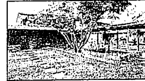
SPECTACULAR LAKEFRONT ESTATE designed by Don Paul Young, 290' of the finest frontage on Island Lake. Library, studio, five bedrooms and 6 1/2 baths. Fabulous lake views. It doesn't get any better! (644-6300) B13769