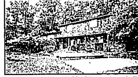
SPACIOUS CONTEMPORARY, custom built Frankel home in beautiful Woodcock Hills. 5 bedrooms, 3 full baths, make this a wonderful family home. Large, nicely landscaped lot. Elementary school in sub. $220,000. (851-5500)