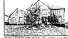
EXCELLENT FLOOR PLAN with all the amenities. Front and rear staircases, oak paneled library with French doors, wood flooring, walk-out lower level, beautifully landscaped lot, 3 car garage. Rochester. $374,000. (651-7300) 108482