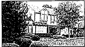
STRIKING BRIDGE CONTEMPORARY set on professionally landscaped lot overlooking trees and stream. Spacious open floor plan, vaulted ceilings, skylight, charming serene garden room plus other amenities. $285,000. (851-5500)