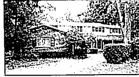
WOODED RAVINE SETTING with your own stream! Spacious 4 bedroom colonial features open floor plan with spectacular views. Completely finished walk-out lower level. Birmingham Schools. $374,500. (644-6300) B13502