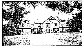
BLOOMFIELD TUDOR has three fireplaces, five bedrooms, including three spacious bedroom suites. Ideal for family comfort or lavish entertaining. Front and rear stairways. Large room. Three car garage. $459,000. (644-6300)