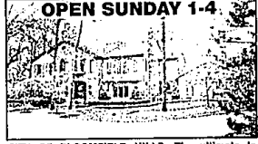
CITY OF BLOOMFIELD HILLS. The ultimate in gracious living on 1.9 acres of treed and landscaped setting. Designed for entertaining or comfortable family living. Four car garage, tennis court and more! (644-6300) B12418