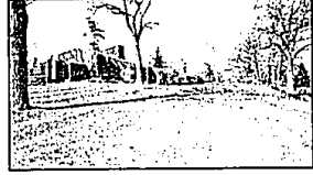
MAGNIFICENT SITE and residence on Island Lake. Landmark architecture by Aidon Dow. Possibly the finest location in Michigan. A truly extraordinary residence. Seven bedrooms, library, upper level family room. (644-6300)