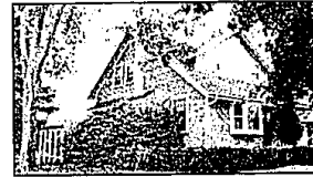
A 1920'S HOUSE situated on a deep, picturesque corner lot within sight of Quarten Lake. Living room with fireplace, three bedrooms, 1 1/2 baths, dining room, basement. An easy walk to downtown Birmingham. $239,000. (644-6300)