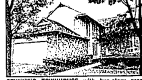
STUNNING TOWNHOUSE with two-story great room, magnificent hardwood flooring thru-out 1st level. Impressive living room fireplace, family room, master with two walk-in closets, 3 bedrooms. $249,900. (644-6300) B13781