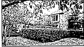
BEAUTIFULLY APPORTIONED Bloomfield Hills Robertson townhouse. Lovely courtyard entrance, 3 bedrooms, 2 1/2 baths, 3 fireplaces, walk-out lower level. Spectacular views from 3 levels. Gated community. $355,000. (644-6300) B16053