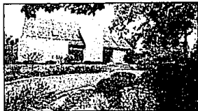
SPECTACULAR Chestnut Run 4 bedroom contemporary is loaded with extras such as 2-story great room with 5 skylights, recessed lighting, granite Island kitchen, sunny breakfast nook, walk-out lower level. (644-6300) B15820