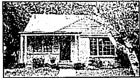
CHARMING BIRMINGHAM BUNGALOW with hardwood floors, library, 3 bedrooms including master with an adjoining sitting room, finished recreation room and an exercise room. Newer central air. $128,900. (644-6300) B16036