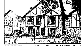
CHARMING second floor Bloomfield Hills Condo in a quiet location with lovely views. Two bedrooms, two baths, kitchen appliances and central air. Dumbwaiter from garage level to second floor. $99,000. (644-6300) B13599