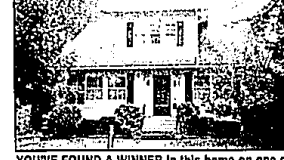
YOU'VE FOUND A WINNER In this home on one of the best walk-to-town streets in Birmingham. Bright living and dining rooms with 9' ceilings, crown moldings, upstairs sitting room and more. $214,900. (644-6300) B13779