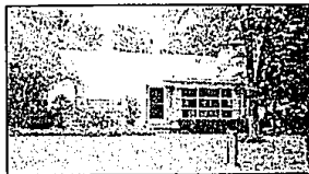
PRICED TO SELL! This charming Beverly Hills starter or empty nester home has refinished hardwood floors, living room fireplace, newer kitchen, 3 bedrooms and lovely private yard with brick patio. $104,900. (644-6300) B15992