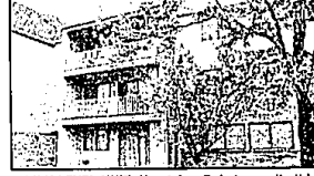
ENTRY LEVEL UNIT. No stairs. Only two units this level. Walk-out to private patio. Neutral decor, two bedrooms, two baths, master has walk-in closet and newer stall shower. Garage with door opener. $75,000. (851-5500) B16022