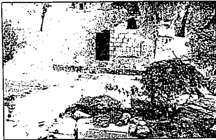
Might be: Gordon's Garden Tomb is a site that some archeologists believe is similar to the tomb Christ was buried in.