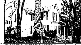
CHARMING HISTORIC HOME formerly on home tours. Renovated kitchen and baths, Bullseye woodwork and marble hearth. Large wooded lot. Walk to town. Guest house on property. Wonderful unique home. $220,000. (851-5500)