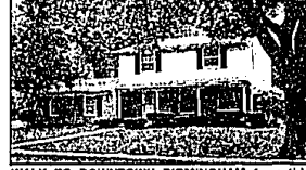
WALK TO DOWNTOWN BIRMINGHAM from this four bedroom colonial. Family room with fireplace and access to patio, finished recreation room, hardwood floors, and private fenced yard. Move right in! $219,900. (644-6300)