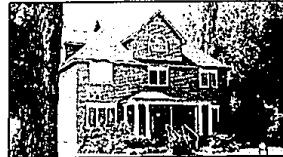
SUPERIOR DESIGN and craftsmanship with soaring ceilings, center island Euro-style kitchen, family room, dramatic 2-story master suite, third floor office or studio. Short walk to downtown Birmingham. $499,000. (644-6300) B14628