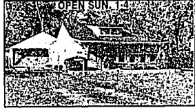
COZY NORTH ROYAL OAK RANCH. Two bedrooms, enclosed front porch, wet plaster, cove ceilings. Newer dishwasher and disposal, patio, 2 1/2 bath garage. $54,900. 4015 Kent, S. of Normandy, W. of Crooks. (689-7300) S17027