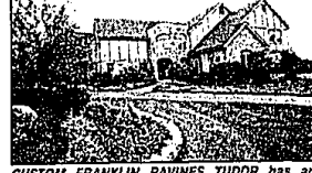
CUSTOM FRANKLIN RAVINES TUDOR has an open floor plan with an impressive two-story marble foyer, gourmet kitchen, french doors leading to the wrap-around deck, family room and four bedrooms. (644-6300) B15777