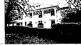
WHERE'S SCARLET O'HARA? Large trees frame this Southern Colonial with library, family room, 4 bedrooms, 3 baths. Lovely grounds and pool. Close to nationally acclaimed Bloomfield Schools. $443,900. (644-6300) B14625