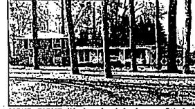
MOVE RIGHT IN. Lovely 4 bedroom, 3 1/2 bath home. Two fireplaces, finished lower level walk-out. Neutral decor. Central air now '91. All appliances included. Large treed lot. Birmingham Schools. $182,900. (689-7300) S16997