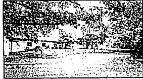
KERN LAKE FRONTAGE in the City of Bloomfield Hills. Vaulted ceiling living room, family room, 2 fireplaces, 3 bedrooms, large master suite with marble bath and 2 person whirlpool tub. $329,000. (644-6300) B15924