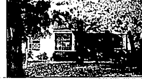
CHARMING BIRMINGHAM BUNGALOW. Walk to town. New carpet, paint, refinished oak floors. Large bay window in living room. French doors to Florida room. Three bedrooms, 1 1/2 baths. Too good to pass up. $159,000. (851-5500)