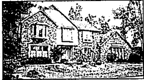
METICULOUSLY MAINTAINED TUDOR on professionally landscaped and treed lot. Library, family room, 4 bedrooms, 2 1/2 baths. Crown moldings, 6-panel doors, wood floors. Large deck. Very nice. $314,500. (644-6300) B15699