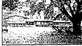
THIS FRANKLIN VILLAGE four bedroom quad-level home is on a fabulous setting backing to a pond, many trees, flowers and wildlife. Both a library and family room. Two fireplaces. A hundred roses! $319,000. (644-6300) B15923