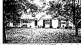
WESTCHESTER VILLAGE RANCH - A great value home. Many updates including newer kitchen with appliances. Living room fireplace, library, 3 bedrooms, and 1 1/2 baths. Neutral decor. Deck. $149,900. (644-6300) B15922