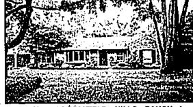
EXPANSIVE BLOOMFIELD HILLS RANCH has Wing Lake privileges. Great room, library, family room, three bedrooms, three baths. Central air. Extensive updating with many mirrors. $229,900. (644-6300) B12963