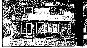
LOVELY FOUR BEDROOM HOME in the Midvale School area is on a deep, private lot. Formal living and dining rooms, updated kitchen with newer appliances, family room with raised hearth fireplace. $239,900. (644-6300) B15697