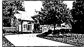
UNIQUE SETTING for this 3 bedroom, 2 1/2 bath home situated on private wooded lot with exceptional landscaping. Library with wood flooring, 3 beveled french doors, crown moldings. Rochester. $248,000. (651-3500) 109368