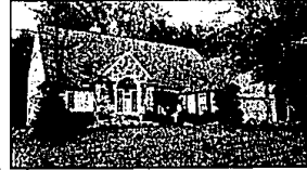
PREMIUM WOODED, PRIVATE SETTING! This spacious and very sharp 3 bedroom home has it all! Magnificent entertainment center family room, an enormous brick paved patio, walkway and much more. $329,900. (644-6300) B15856