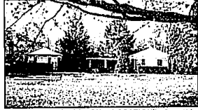
"LOCATION, LOCATION, LOCATION" for this Bloomfield ranch with open foyer, floor to ceiling windows, three fireplaces, family room, large master suite, garden room, recreation room and patio. $339,000. (644-6300)