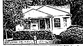
CHARMING BIRMINGHAM BUNGALOW is clean, freshly painted and ready for the new owners. Two bedrooms, hardwood floors, basement and garage. Patio with BBQ grill. Close to downtown shopping. $79,900. (644-6300) B14116