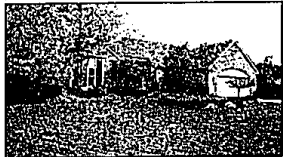
BLOOMFIELD HILLS ADDRESS and Birmingham Schools. Open floor plan with crown moldings, hardwood floors and loft. Living and family room fireplaces. Three bedrooms, 3 1/2 baths. Loaded with quality amenities. (644-6300)