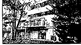
INVITING OPEN FLOOR PLAN great for entertaining. Recent updates include newer carpet, kitchen floor and painting. Extra bonus loft on second floor can be library. Finished lower level walk-out. $104,800. (851-5500)