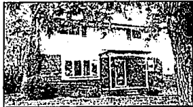
CONVENIENT ROYAL OAK LOCATION. Colonial with den or 4th bedroom on first floor, living room fireplace, large breakfast area. Two baths. Hardwood floors. Newer furnace and central air. $129,900. (644-6300) B15495