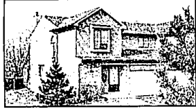
AVAILABLE IMMEDIATELY, 2-3 bedroom, completely redecorated condo in a unique 18 unit complex. Appliances included, finished lower level, attached garage. Birmingham Schools. Walk to shopping. $119,900. (644-6300) B14548