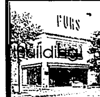
Lazare's Furs Famous Unaltered Furs Since 1925

30% Premium On U.S. Funds 3 DAYS ONLY All Prices In CND Funds