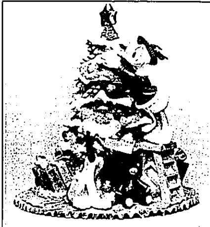
Above, a miniature of Donald and Goofy trimming the tree, found at The Disney Stores, is scaled to fit any stocking!

Characters from all the popular Disney movies—Pooch Bear, Mickey and his friends, Belle and the Beast—show up on same or additional products: pencil toppers, magnets, figurines, musical toothbrushes, night lights, glitter pins, trading cards, purses, key rings, sticker sets, trading cards, wristwatches ($1-5).