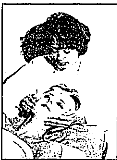
An expert gives the customer a relaxing and soothing facial at Tamara.

Think about your activities from January to October. Throw in the months of November and December when your normal daily routines are multiplied by the demands of the holidays: shopping, gift-wrapping, food-preparing, house-decorating and party-giving or going. It's a recipe for stress and few people this time of year make it through the season without some frazzled feelings.