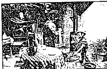
Left, one for the animated scenes from the Hudson's Pinocchio exhibit, on display through the holidays to delight children of all ages.

the characters' costumes. Hudson's holiday exhibit is a traditional gift to the community. For additional information concerning the Pinocchio exhibit, customers may call 313-442-6048.