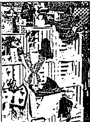
Inside, Genitti's is chock full of great gift ideas in colorful shops.

"We're offering two different plays. 'Mistletoe Madness' is presented in the restaurant while our customers dine. It's a murder mystery comedy that entertains everyone," she said. "It has such charac