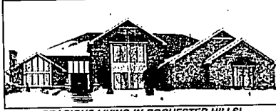
GRACIOUS LIVING IN ROCHESTER HILLS!

Custom five bedroom home on 1.58 acres in the City of Bloomfield Hills. Extensive work, vaulted ceilings, unique floor plan with 6200 sq. ft. including lower level walk-out. Listed at $995,000. Make an offer. 647-0100 B17496CRA