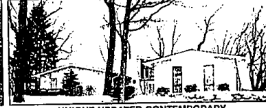
UNIQUE UPDATED CONTEMPORARY

on wooded acre natural setting. Gourmet kitchen, 1st floor master suite. Three additional bedrooms, 2.5 baths. Great room, formal dining room, library, walk-out lower level, central air, 3 car garage. $374,000 645-2500 B16565FOU