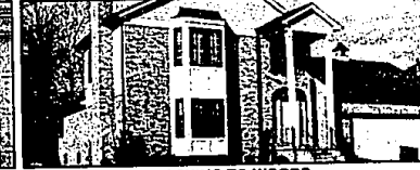
BACKING TO WOODS

Three bedroom "Pinecrest" condo overlooking woods and stream. Marble foyer, two docks, three fireplaces, finished lower level with walkout. First floor laundry. Includes all appliances. Private setting. $209,000 645-2500 B16375VG