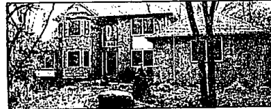
NEWER DREAM HOUSE

Wooded lot. Four bedroom, 3.5 baths with vaulted ceilings, bay windows, three fireplaces, and some hardwood floors. Great room, 3 decks, French doors. Three car garage. Robertson Bros. built. $389,000 645-2500 B17564PAR