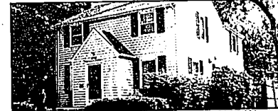
FABULOUS CUSTOM BIRMINGHAM COLONIAL

on wonderful wooded private ravine lot. Family room with fireplace, four bedrooms, lower level library or 5th bedroom, 3 baths plus lav, finished walk-out. Rec room with wet bar. Central air. Birmingham Schools. $279,000 645-2500 B17350