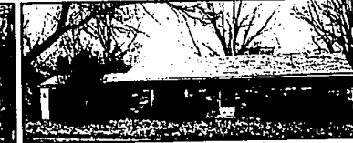
LOTS OF POTENTIAL!

Country home on one acre, yet, walk to city conveniences. Decidably roomy. Picket fence, leaded front door, two-car heated garage. Inside: plush green carpet, four bedrooms, library, sun porch. Call now! $128,900 645-2500 B16553HIC