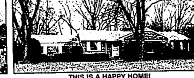
THIS IS A HAPPY HOME!

Unusual floor plan. Ceramic tile, skylights and vaulted ceilings enhance this home in Troy's Wattles Square. 3 bedrooms, 3 full bathrooms, and finished basement. Close to shopping, and schools. $189,900 645-2500 B16737WAY