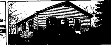
STYLISH BIRMINGHAM RANCH

in the city. Three bedroom, 1.5 bath home, professionally updated throughout. by JMK Investment Service, Inc. Additional improvements may be added by the buyer & financed on the mortgage. 645-2500 403056LEB