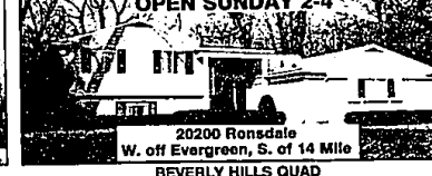
OPEN SUNDAY 2-4

Ranch with dramatic wooded hilltop setting. Cathedral ceilings, newer kitchen, furnace and roof. Master suite plus 2 bedrooms 2 lavs, 1st floor laundry. Formal living room, central air, 2 car garage. $212,000 645-2500 404797LAH