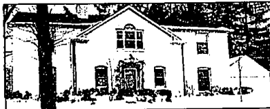
DISCOVER ONE OF BIRMINGHAM'S

Three levels with a finished walk-out lower level to patio. 5600-plus sq. ft. 4 large bedrooms. Great room with fireplace of boulders. Family room, updated kitchen, workshop, 3 car garage. $499,900 647-0100 B08655BLO