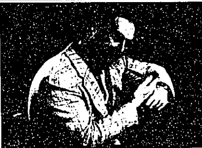
Back in the infancy of television, Sid Caesar captivated audiences with "Your Show of Shows." A&E's "Biography" focuses on this TV pioneer on Tuesday with "Sid Caesar: Television's Comedy Genius."