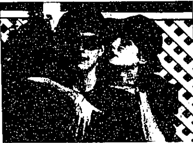
Joe Goodson (Tom Cruise) and his new girlfriend (Rebecca De Mornay) embark on the tins of their lives, including a narrow escape from Guido the liber pimp, as Fox airs "Risky Business" on Monday.