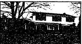
NEWER BLOOMFIELD HILLS COLONIAL. Library with French doors, kitchen with Amish cherry cabinets and granite island. Family room. Two fireplaces. 5th bedroom converted to 1st floor laundry. $334,000 (644-6300) 415673