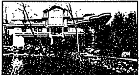
YEARS OF PLANNING, DESIGN AND EXPERTISE have gone into a famous builder's own dream home. High on a bluff, this unique contemporary captures views of Island Lake shared by others. (644-6300) 411351