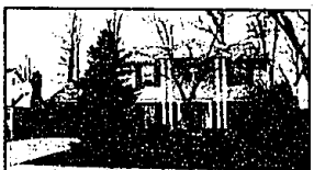
SHARP COLONIAL IN TROY with newer neutral carpet. Kitchen has Pella bay window with bench, newer sink, faucet, counters, flooring, appliances. Newer roof, Pella doorwall in family room. $184,900 (644-6300) 416704