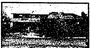
CALIFORNIA STYLE in private setting in Woodlands of Orchard Lake. Vaulted living room ceiling, library, fireplace in family room and master bedroom, family room with doorwall to deck. $338,900. (644-6300) 405381