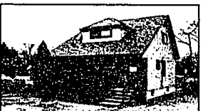
ROYAL OAK OFFICE BUILDING. Nicely converted 2-story residential building with office space on each level. Zoned light commercial. Extensive improvement list. Lots of storage. Main Street frontage. $144,900 (644-6300) 416048