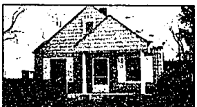
GREAT IN-TOWN BUNGALOW with many extras. Three bedrooms, 1 1/2 baths. Hardwood floors on first floor. Appliances included are stove, refrigerator, washer and dryer. Two car garage, basement. $139,000 (644-6300) 410793