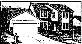
EDGINGTON FARMS —Four bedroom, 2 1/2 bath colonial offering oak flooring in foyer and den, cathedral ceiling and fireplace in family room, first floor laundry, breakfast area, formal dining room. Rochester. $208,000 (851-3500) 405781