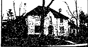
FRENCH NORMANDY TUDOR on beautiful lot. Architectural excellence with dormer, hip roof, archways, old world charm and quality. Large stone trimmed fireplace in living room, updated kitchen, 2 stairways. $399,900 (644-6300) 416828