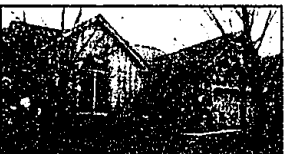
QUIET ELEGANCE best describes this superior located condominium. Large 12x11 foyer. Extensive use of hardwood floors. 6 panel doors throughout. Cathedral ceilings contribute to the spacious feeling. (644-6300) 416243