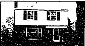
CITY OF BIRMINGHAM 3 BEDROOM HOME. Good floor plan. Hardwood floors. Neutral new carpeting, cove ceilings. Fireplace in living room. Dining room. Wonderful deck overlooking fenced yard. $124,900 (644-6300) 416856