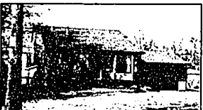
SHARP, NEUTRAL CONTEMPORARY. Vaulted ceilings, bay window in living room, newer carpet and freshly painted. Beach privileges and boat launch on all sports Middle Straits Lake. West Bloomfield Schools. $125,000 (851-5500)