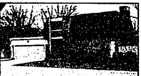
QUALITY BLOOMFIELD HILLS CONDO. Marble foyer, vaulted ceiling, great room, master bedroom spa bath. Newer kitchen and furnace. Elaborate rec room entertainment center, 2 wet bars. $220,000 (644-6300) B18878