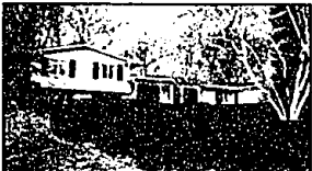
QUIET LOCATION IN BEVERLY HILLS. Dramatic foyer introduces buyer to light and bright home. Many updates including roof, doorways, master bedroom closets. 4 bedrooms, family room. $219,000 (644-6300)