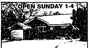
CHARMING LATHRUP VILLAGE RANCH. Over 1,200 sq. ft. Includes den. Basement rec room (12x22). Hardwood floors. Natural fireplace with gas logs. $98,900. 18749 Sunnybrook. N. of 11 Mile, W. of Southfield. (889-7300) 411229