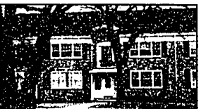
ENJOY PRIVACY of the second floor with two bedrooms, two baths, newer kitchen, furnace, tile, neutral decor, decorative fireplace. Near airport, sport club, theatre, shopping. Great location. $102,900 (851-5500)