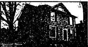
HANDSOME QUIANT TURN-OF-THE-CENTURY home in old Birmingham. Renovated in recent years. Distilling will appeal to the traditional or contemporary taste. Large kitchen, vaulted ceiling. Deck. $298,888 (644-6300)