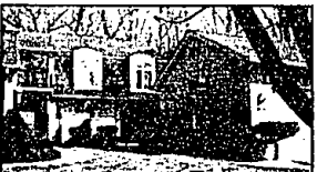
LIGHT AND BRIGHT CONDO backing up to woods for privacy. Mirrored living room walls. 3 bedrooms. Carpeted lower level finished with built-in desk area and computer room. New carpeting. $182,000 (644-6300) 405793