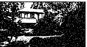
STUNNING CONTEMPORARY in Farmington Hills shows like new. Dramatic open floor plan. Vaulted ceilings. Custom granite/mirrored fireplace. 4 bedrooms. Amenities galore. Beautiful setting. $365,900 (851-5500) B12753