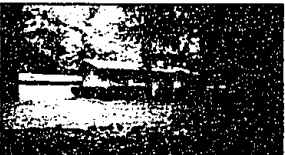
UNIQUE CONTEMPORARY BI-LEVEL HOME located on a quiet, cul-de-sac on over an acre of beautifully wooded property. 4 bedrooms, 2 baths, 2 fireplaces, lots of skylights. Many updates. $248,000 (644-6300) B15981