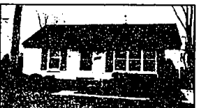
IN-TOWN BIRMINGHAM RANCH. Great two bedroom starter home with brick and aluminum exterior. Kitchen includes stove and refrigerator. Family room. New furnace. Newer storms and some windows. $119,900 (644-6300) 416855