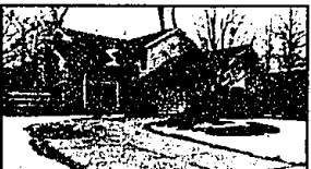
UNIQUE QUIET SETTING situated on private wooded lot with exceptional landscaping, 2 decks and brick pavers. Library with wood flooring, 3 bedrooms, 3 beveled French doors, crown moldings, Rochester. $244,900 (851-2500) 411548