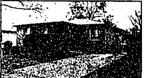
WELL LOCATED RANCH in quiet sub. Natural wood trim, hardwood floors, neutral carpet. Florida room off dining room. Partially finished basement, newer furnace, central air, carpet, roof. $70,900. (899-7300) 414740