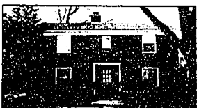
BRICK CENTER ENTRANCE COLONIAL in prime area. Between Quarton Lake Estates and Bloomfield Village. 3 bedrooms. Many high quality details. Recreation room with fireplace and screened porch. $219,000 (644-6300) 411207