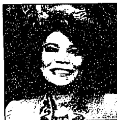
Barbara Walden: "Still going strong."

In 1968, actress Barbara Walden had to make a big decision. Should she take the lead role in the new television series, The Nurses , or continue to launch a line of cosmetics for the woman of color?