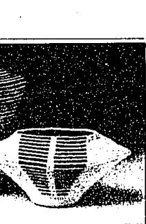
Hours are 11 a.m. to 6 p.m. Tuesday-Saturday. Call (810) 644-3388.

public Saturday, June 18, and closes Sunday, June 26. Hours are 11 a.m. to 5 p.m. daily, except when the show closes 2 p.m. June 26. Entry forms are due Monday, June 6. For entry forms, write the Art Committee, Congregational Church of Birmingham, 1000 Cranbrook Road, Bloomfield Hills 48013, or call the church at (810) 646-4511. Entry forms must be accompanied by a $10 entry fee. Paintings, drawings, collages, hard and soft sculpture, graphics, photography, ceramics, glass, jewelry and fiber are eligible for entry. Each artist is limited to the entry of two works. Paintings and hangings mustn't exceed 6 feet in width or length and must be prepared for hanging. Sculptures mustn't exceed 5 feet by 5 feet by 6 feet and