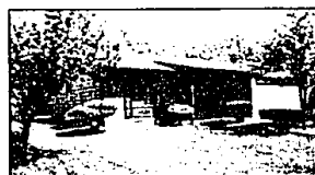
GOOD SOLID TROY RANCH for younger couple overlooking nature wooded park. Kitchen overlooks 14'x19' family room with fireplace, 3 bedrooms, partially finished basement, 2 car attached garage. $124,900 (644-6300) 425374