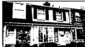
BEVERLY HILLS TWO BEDROOM , two and a half bath townhouse. Living room with doormat to patio, eating area in kitchen, master bedroom with bath and walk-in closet. Neutral decor. Basement, carport. $124,900 (644-6300) 418075