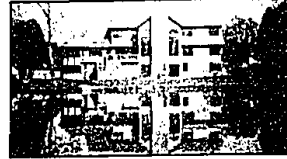
CUSTOM BUILT WING LAKE HOME , only three years old. Open foyer, wide halls, elevator, skylights, unusual brickwork, specially designed millwork with built-ins, paneled doors, extensive wood railing. (644-6300) 415133