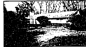
BEAUTIFUL WOODED DOUBLE LOT and Wing Lake privileges! Very large 15x26 family room, Florida room, three window bay in living room. Newer roof, storm doors, driveway. Garage has stairway to storage. $187,900 (644-6300) 425373