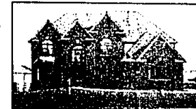
SPECTACULAR FIVE BEDROOM TUDOR home with many amenities including gourmet kitchen, master bedroom sitting room, two staircases and library. Finished lower level with fireplace, Rochester. $495,000 (851-3500) 416108