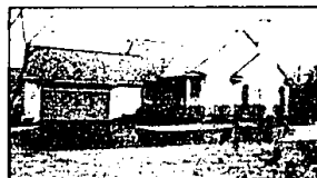
CITY OF BLOOMFIELD HILLS CONDO. Cathedral ceiling in the living room and first floor master suite. Library. Three baths. Solarium adjacent to enclosed deck with fish pond and fountain. $379,500 (644-6300) B17539