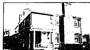
WONDERFUL IN-TOWN BIRMINGHAM condo on Harmon across from park. Fireplace in living room, newer ceramic countertops, hardwood floors in bedroom, carpet in living room, dining room and kitchen. $98,500 (644-6300) 418974