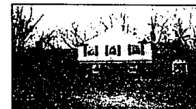
SUPERB VALUE! Four bedroom home on interior site in beautiful Overbrook. 3 fireplaces. Parquet and ceramic kitchen. 31 foot family room, 32 foot rec room, game room and possible 5th bedroom. $379,000 (644-6300) 418110