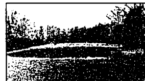
OVER 2.5 WOODED ACRES with pond on prime building site. Troy School District. Utilities at street. Subject to lot split, taxes to be assessed at that time. Zoned RIC. Call for more details. $165,000 (689-7300) 418688