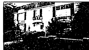
PRIME BLOOMFIELD HILLS LOCATION next to Village Club. 3 bedrooms, 2 baths. Master bedroom has 2 closets. 3rd bedroom paneled - could be den. Dining room. Balcony and porch. 2 car garage. $123,900 (644-6300) 414111