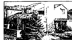
BLOOMFIELD HILLS end unit townhouse has 2 bedrooms including a luxurious, extra large master suite. Cathedral ceiling in living room with fireplace. 1st floor laundry. Attached garage. Pool, tennis. $128,000 (644-6300) 401098