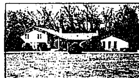
ATTENTION DAILY EXERCISERS. Indoor pool 20x40 with spa and lake privileges on Wing Lake. Updated kitchen. Marble floor, leaded glass doors in foyer. Finished basement. 5 bedrooms, 4 baths. $395,400 (851-5500)