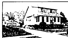
ROYAL OAK COLONIAL. Three good sized bedrooms plus an extra bonus room upstairs. Dining room, loads of storage, unfinished walk-out basement, 2 car garage. Immediate Possession. $90,000 (689-7300) 420734