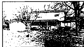
UPDATED FOUR BEDROOM COLONIAL with neutral decor. Hardwood floors in living and dining rooms. Fireplace in family room. Kitchen with oak cabinets and pantry. Trees at back of property. $149,900 (651-3500)