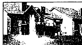
EXECUTIVE RETREAT overlooking pond. Beautiful views from great deck. Lavish interior done in white and neutrals. Hardwood floors, 6 paneled doors, completely finished lower level, 3 bedrooms, 3 1/2 baths. $205,000 (851-5500)