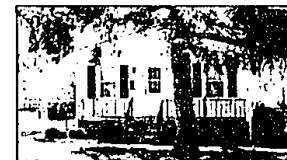
GREAT BIRMINGHAM IN-TOWN HOUSE! Neat and clean. Updated bath and eat-in kitchen with ceiling fan. Appliances stay. Nice curb appeal with porch across front. Lots of storage. Oversized garage. $77,900 (644-6300) 426349