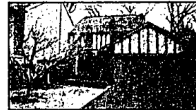
PRIVACY ABOUND amidst towering trees in this 3 bedroom, 3 1/2 bath condo. 3 fireplaces, breakfast area with greenhouse window overlooking courtyard. Decks. Lower level walk-out, gated entrance. $284,500 (644-6300) B15993