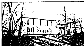
STATELY HERON BAY COLONIAL is light and airy. This fabulously appointed, "like new" home has library, family room, four bedrooms, 5 1/2 baths. First floor laundry, three fireplaces, rec room, deck. (644-6300) B17688