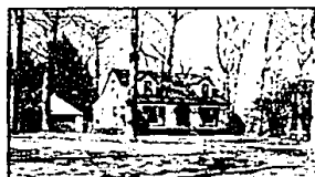
MINI ESTATE in Bloomfield Township Cape Cod surrounded by oaks on over 1.5 private green acres. Living room with fireplace, paneled den, updated kitchen. Glassed and screened porch with beamed studio ceiling. $189,900 (644-6300) 425375