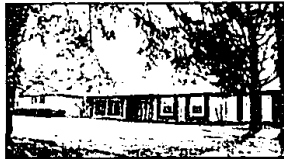
UPDATED FOUR BEDROOM FOXCROFT RANCH! Fireplaces in living and family rooms. Newer furniture, air conditioning and air filtration system. Screened porch. Patio. Lot overlooks park. $239,900 (644-6300) 417949