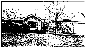
LOWEST PRICED RANCH with finished walk-out lower level in West Bloomfield complex. Fabulous views of treed, ravine site with stream, dramatic ceilings, skylights, 2 fireplaces. $187,900 (851-5500)