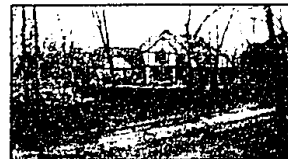
BEAUTIFUL ECHO PARK LOCATION and quality appointments throughout. Elegant foyer with circular stairs. Walk-out lower level with complete kitchen, billiards area, work-out area and hot tub. (644-6300) 407814