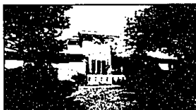
BLOOMFIELD HILLS FOUR BEDROOM COLONIAL. Open, elegant floor plan. Extensive quality. 20x21 marble foyer, newer Berber carpeting. White kitchen with connecting screen and glass porch. Gunite pool. $469,000 (644-6300) 426812