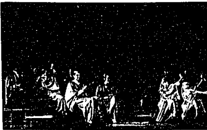
Happy celebration: The Clarenceville Class of '94 broke out the Silly String at the end of the graduation ceremony.