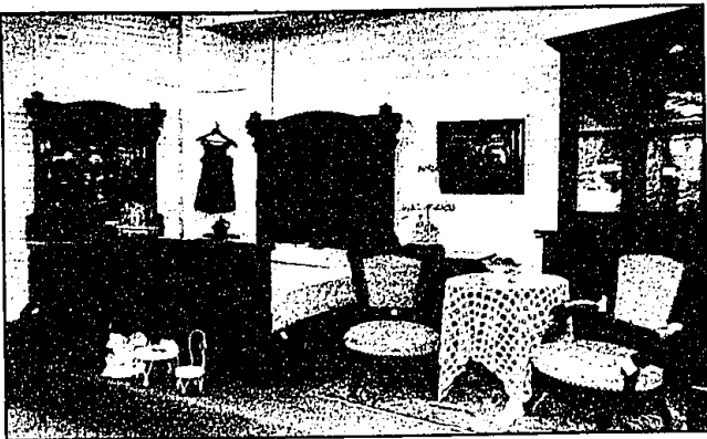
For the bedroom: A walnut bedroom set from the 1870s is displayed in the antique store. Cabinet at right is also walnut from the 1850s.