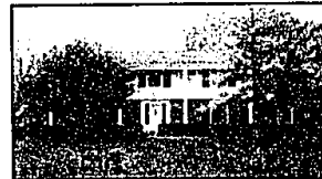
BEAUTIFUL BLOOMFIELD HILLS SETTING overlooking a winding stream. This very well maintained 4 bedroom family home is in a great neighborhood. Both library and family room. Updated kitchen. $209,900 (644-6300) 426525