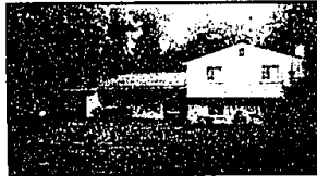
FRANKLIN VILLAGE TRI-LEVEL. Contemporary. Three bedrooms, 2½ baths. Family room with fireplace, library. Newer kitchen carpeting and central air. Finished walkout. Very private and sharp! $183,900 (644-6300) 439298