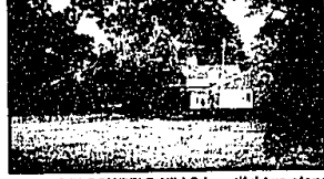
CITY OF BLOOMFIELD HILLS beautiful two story traditional New England style home on 2 acres with pool and brick patio. 2 story master suite with whirlpool tub. Family room and library. Finished lower level. (644-6300) 438748