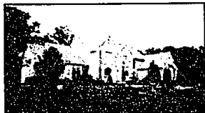
MAGNIFICENT BLOOMFIELD SIX BEDROOM TUDOR on the ravine. Exquisitely executed in detail. Grand foyer, family room, library. Walk-out lower level 30x40 activity room and in-law suite. (644-6300) 445505