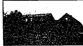
CUSTOM BUILT picturesque salt box colonial situated on beautiful pine-needled lot and surrounded by homes of greater value. Convenient freeway access. Perfect for large family. $229,000 (851-5500) 408544