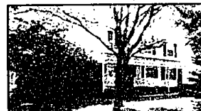
BIRMINGHAM FARMS FOUR BEDROOM COLONIAL on gorgeous oversized lot. Family room with fireplace and Berber style carpeting. New carpet in living and dining rooms and master bedroom. $199,900 (644-6300)