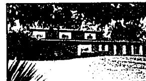
BEVERLY HILLS COLONIAL with marble entry hall, library, family room with fireplace, Florida room. Four bedrooms, 2 full and 2 half baths. 1st floor laundry. Finished lower level. Patio "plus privacy". $227,500 (644-6300) 445790