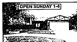
OPEN SUNDAY 1-4 STUNNING UPDATED SOFT CONTEMPORARY with traditional exterior. 2 family rooms, 4 bedrooms, 3½ baths. Deck with electric awning. Rochester. $233,900 722 Timberline, E. of Adams, S. of Tienken. (651-3500) 439278