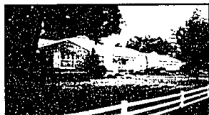
UPDATED THREE BEDROOM FOXCROFT RANCH. Lovely lot with many evergreen trees. Family room. Updated kitchen. Finished basement with recessed lighting. Oak floors. Porch, patio. $239,900 (644-6300) 438746