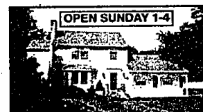
OPEN SUNDAY 1-4 A "KNOCKOUT" FRANKLIN VILLAGE COLONIAL. Marble entry. Fabulous kitchen. 2 fireplaces. Library with French doors, 3 bedrooms. Patio. $375,000 22965 Franklin Ct., S. of 14 Mile, W. of Franklin (644-6300) 446961