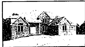
EXQUISITE LIVING describes this new North Oaks tudor with 4 bedrooms, 3 full and 2 half baths. Amenities include oak paneled library, lower level walkout, and kitchen with sitting room. Rochester $434,000 (681-3500) 444920