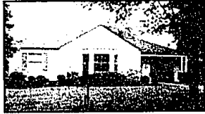
BIRMINGHAM TWO BEDROOM CHARMER. Large living room with hardwood floors, built-in cabinets and gorgeous fireplace and mantle. Separate dining room with French doors to screened porch. $206,000 (644-6300) 429978