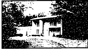
CITY OF BLOOMFIELD HILLS COLONIAL. Backs to Bloomfield Open Hunt Club. Marble entry, beautiful hardwood floors, oak kitchen, 4 bedrooms, family room and library. Renovated with great attention to detail. (644-6300) 446908