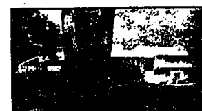
QUALITY BROOKS & WICKER FIVE BEDROOM raised ranch. Brick walled kitchen with fireplace, fluted cherry cabinets, heated green house. Family room, library, walk-out lower level. $396,000 (644-6300) 446817