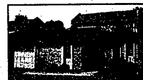
WEST BLOOMFIELD MOON LAKE TOWNHOUSE renovated in 1990. 2 bedrooms, 2 baths, library. Spacious deck with hot tub. Finished daylight lower level recreation room. Pool, tennis court, club house. $197,900 (644-6300) 446703