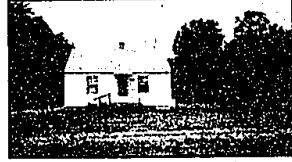
HARD TO FIND IN TROY. Approximately 4 acres, zoned residential, subject to lot split after sale. City water and sewer at street. Small bungalow and garage on property but value is in land. $185,000 (689-7300) 431968