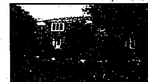
STATELY BLOOMFIELD HILLS FIVE BEDROOM COLONIAL. Many new improvements. Parquet floor in foyer and dining room, circular staircase. Family room, library, recreation room. High lot with circular drive. (644-6300) 446904