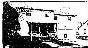
SUPER HAZEL PARK 2-STORY HOME. Three bedrooms, two baths. Newer windows, siding, carpet, kitchen, bathrooms, roof and garage. Two bonus rooms could easily be turned into bedrooms. $69,900 (689-7300) 443476