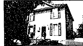
HANDSOME QUAIN TURN-OF-THE-CENTURY home in old Birmingham. Refurbished in recent years. Detailing will appeal to the traditional or contemporary taste. Master bedroom with whirlpool. $249,000 (644-6300) 418488