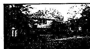
BLOOMFIELD HILLS COLONIAL OVERLOOKING Kern Lake. Cathedral ceiling in living room, family room with fireplace, white kitchen with ceramic floor, master suite with walk-in closet and marble bath. $316,900 (644-6300) 436580