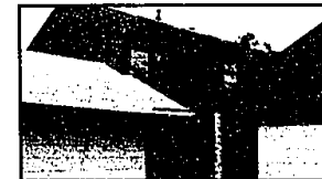
WHY RENT? This townhouse style condo is great for 1st time home buyers. Living room has balcony, 1st floor library has hardwood floors. Finished walk-out lower level. Private courtyard entry. $122,000 (851-6500)